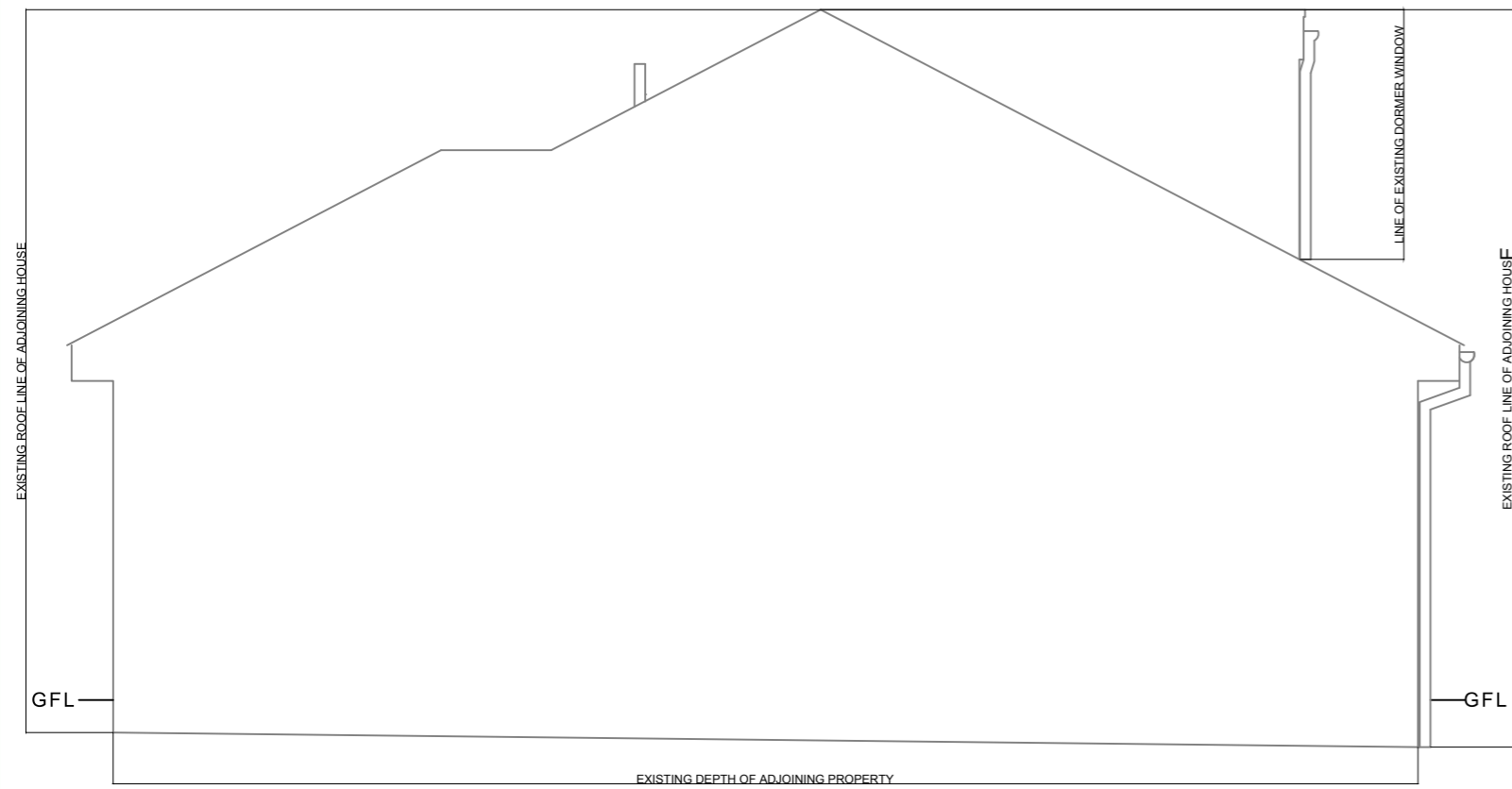
Existing Right Hand Elevation Scale 1:50