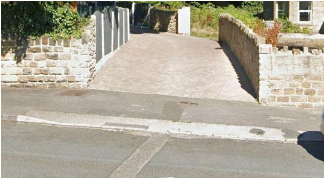
Existing Duke Street entrance

The existing Duke Street entrance currently serves the Church as well as two dwellings.