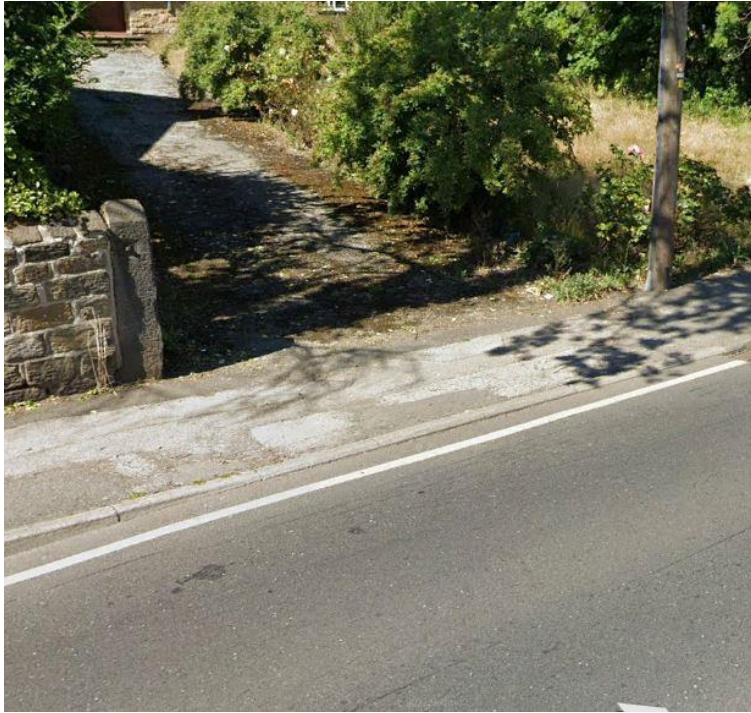
Existing Market Street entrance