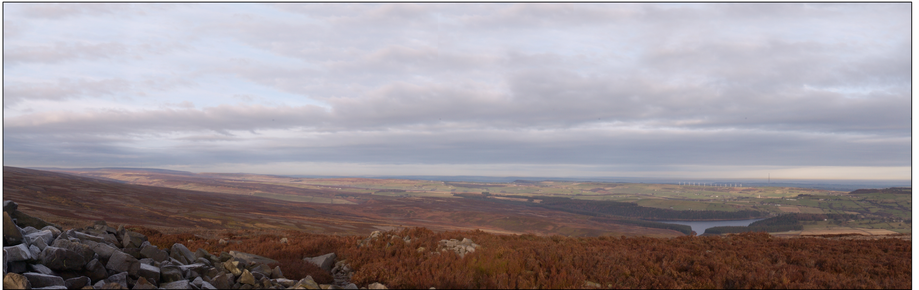
Existing view from viewpoint