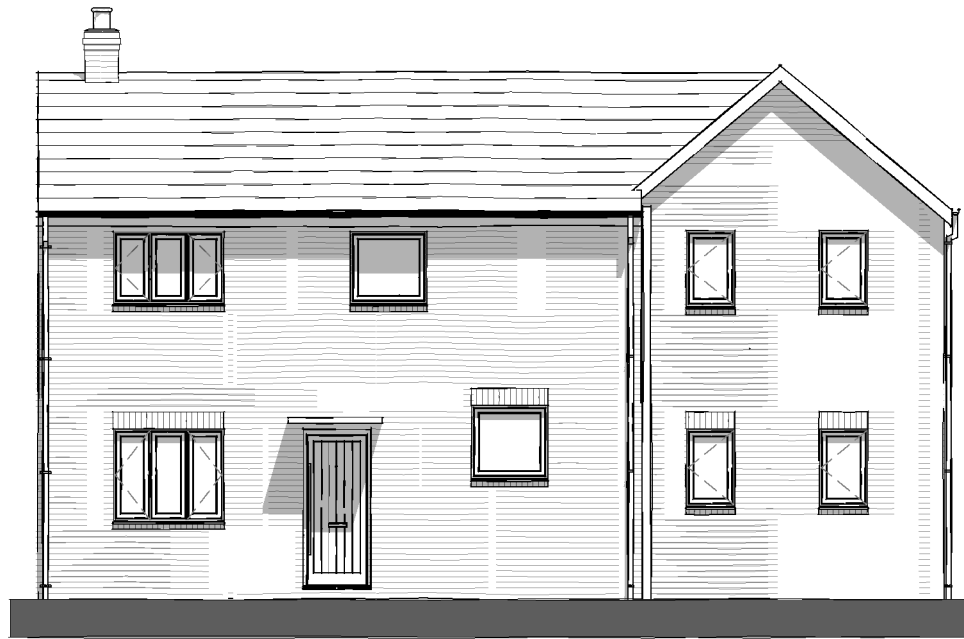
Front Elevation. 1 : 100