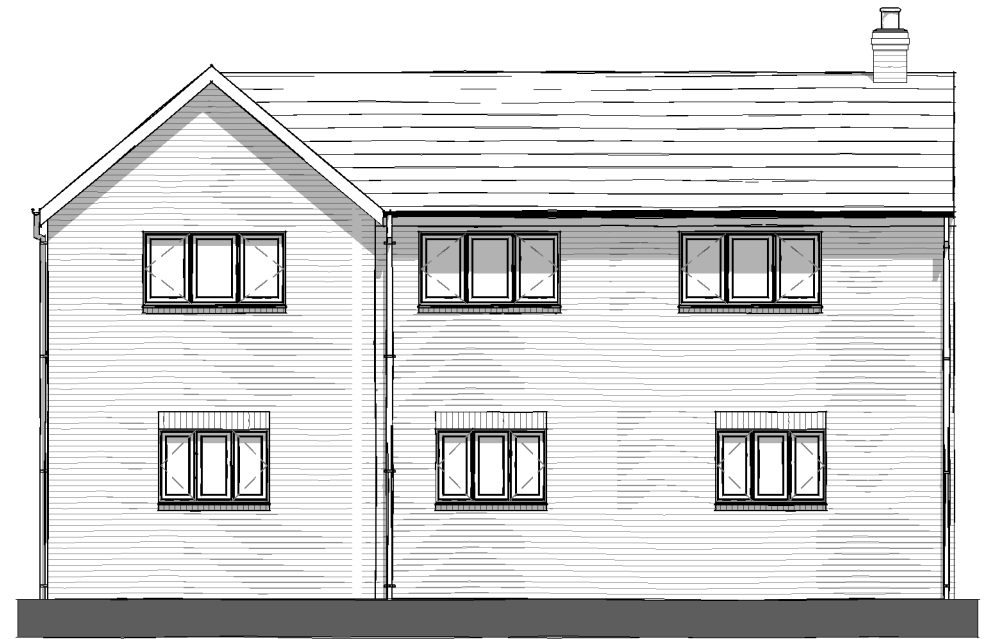
Rear Elevation. 1 : 100