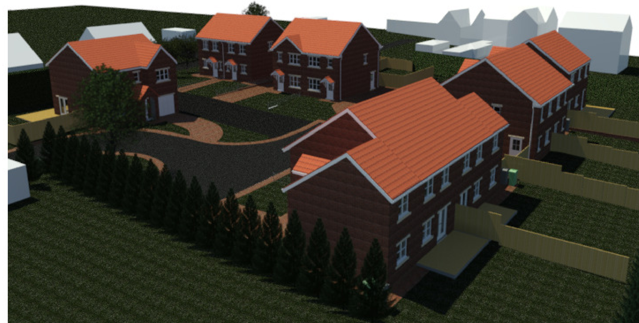
3D View 6 1:1