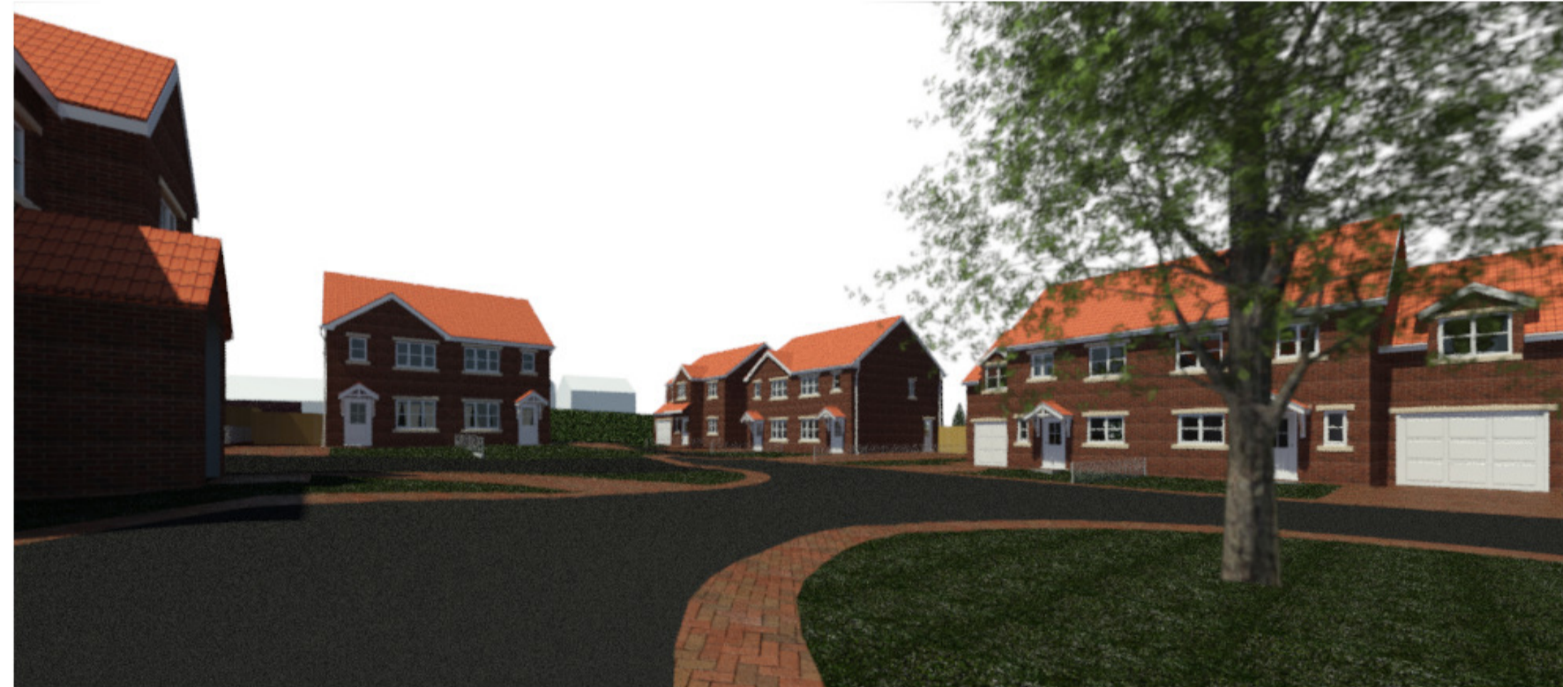
3D View 4 1:1