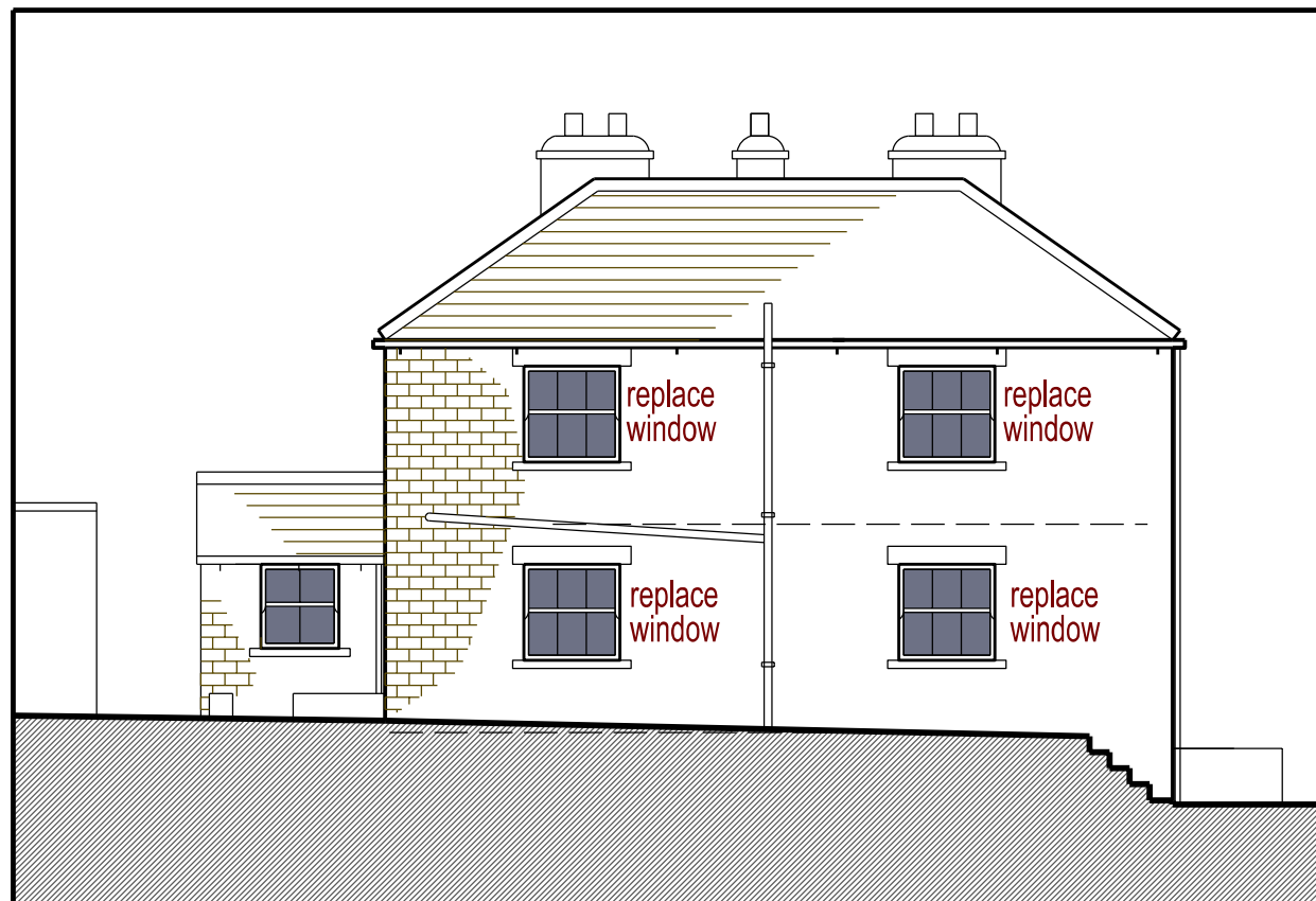
South Elevation - Existing