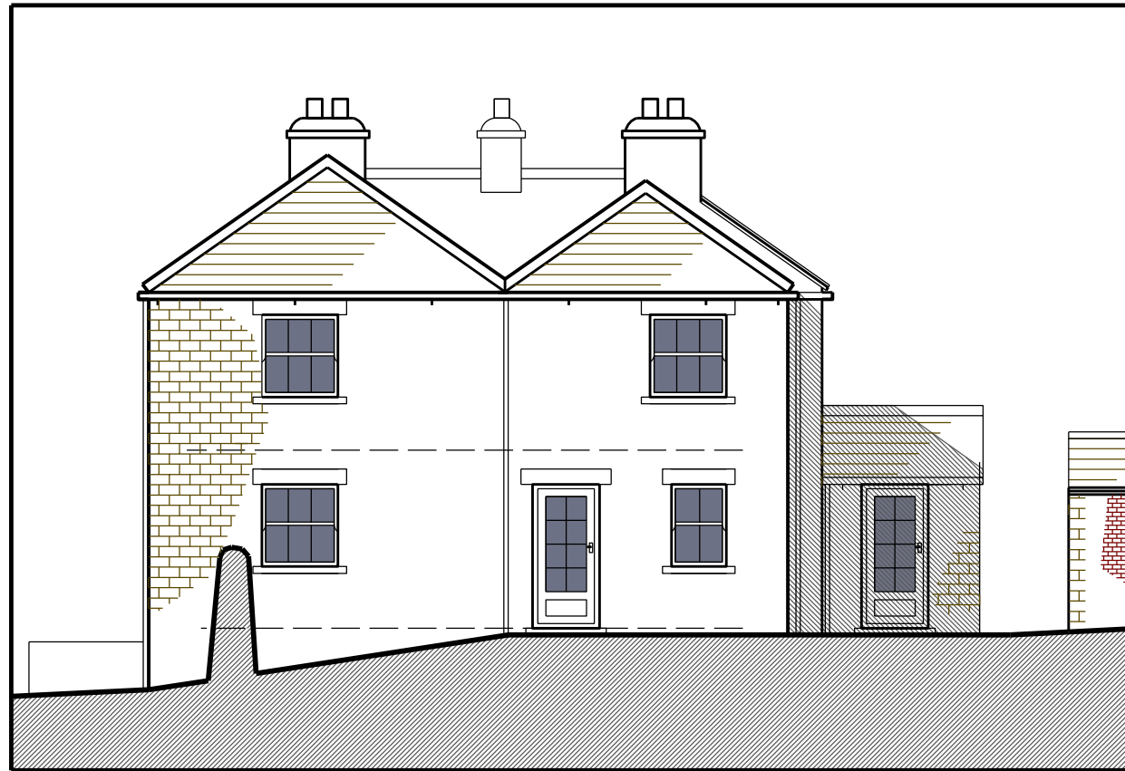
North Elevation - Existing