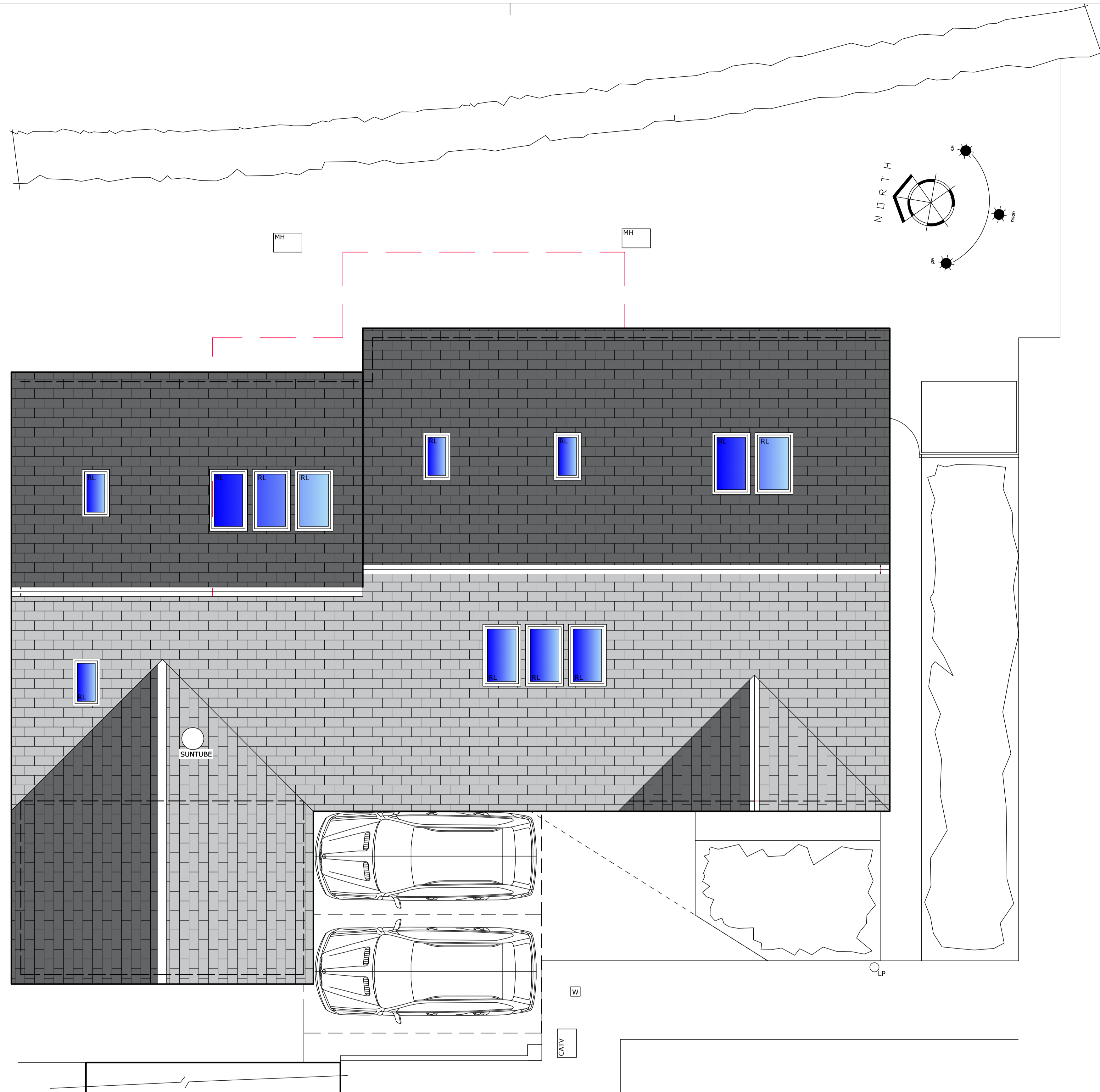
SITE PLAN SCALE 1:50