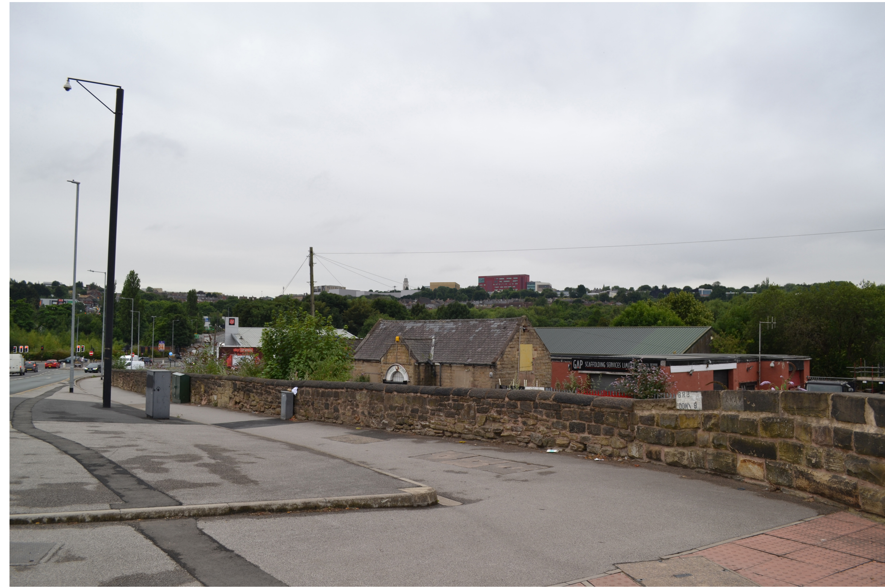
View from Wakefield Road including proposals