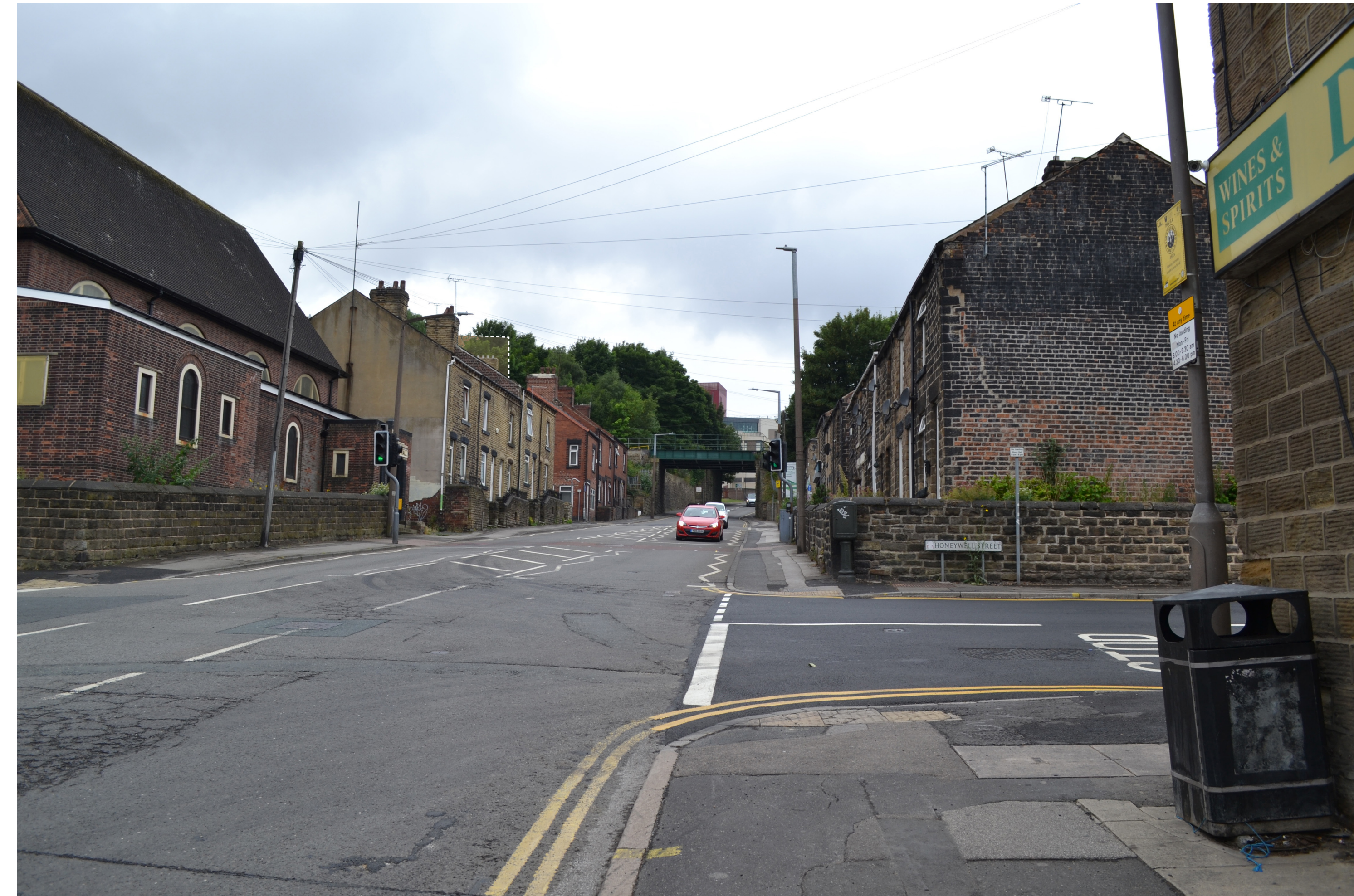
View from Old Mill Lane including proposals