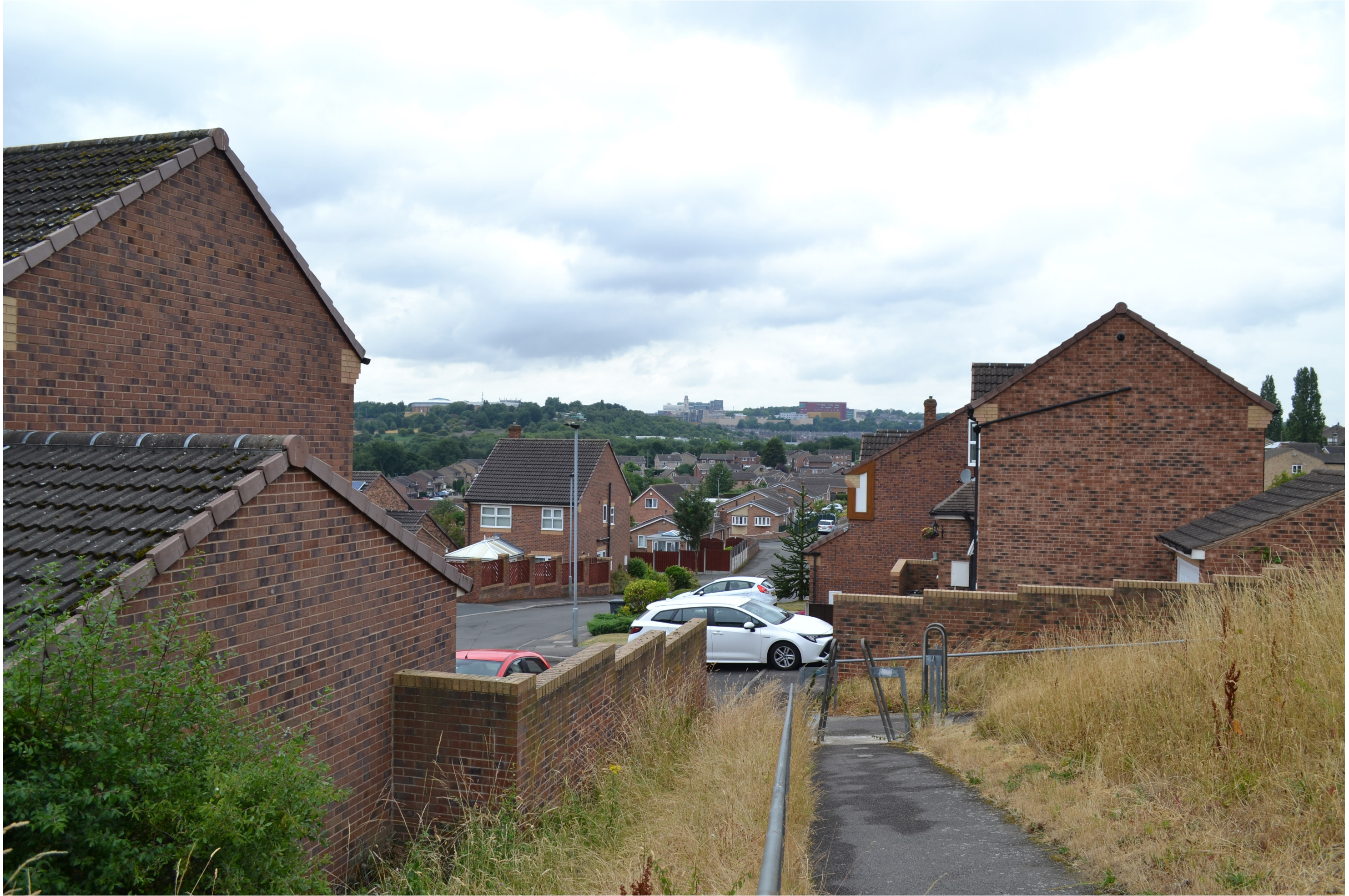
View from Rotherham Road including proposals