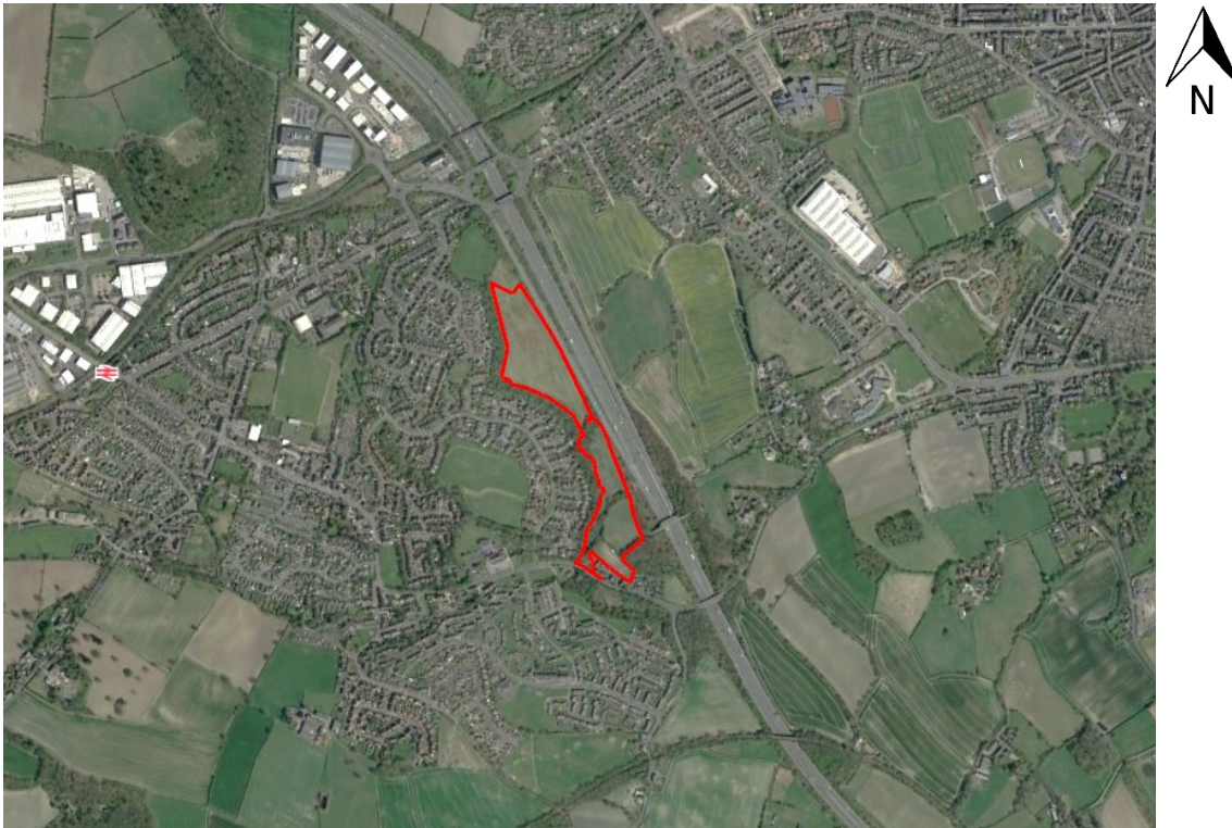
Figure 1. Site Area (aerial imagery dated 2021)

1.1.1.4 This EclA presents the results of specialist ecological surveys undertaken at the site and reviews relevant previous ecological survey information for the site and surroundings. In accordance with current guidelines 1 , the aims of this EclA were to identify and evaluate all relevant ecological receptors, identify likely ecological impacts resulting from the proposed development including the proposed access area, identify mitigation / compensation measures and identify any residual effects.