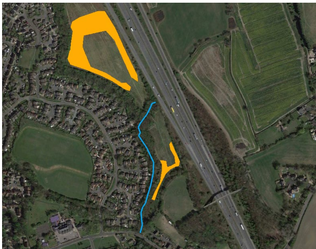
Figure 3. Reptile and Otter Survey Areas

The Ecological Impact Assessment (EclA) has been undertaken in accordance with the standard guidelines 1 .