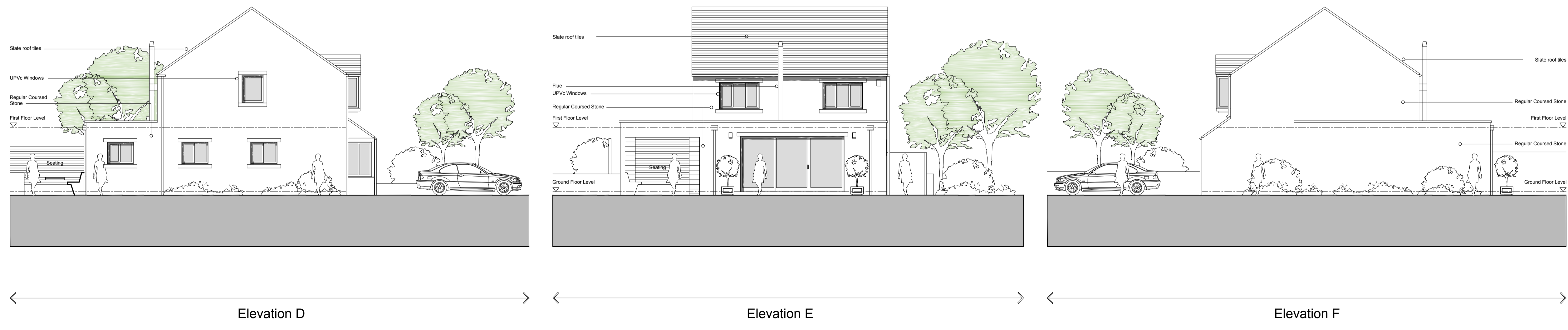
Proposed Elevation 1:100 @ A1