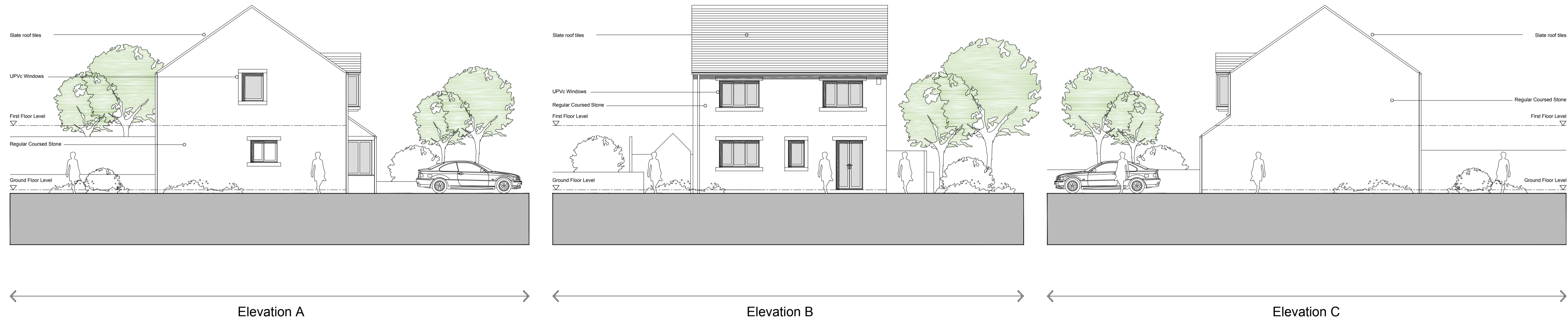
Existing Elevations 1:100 @ A1