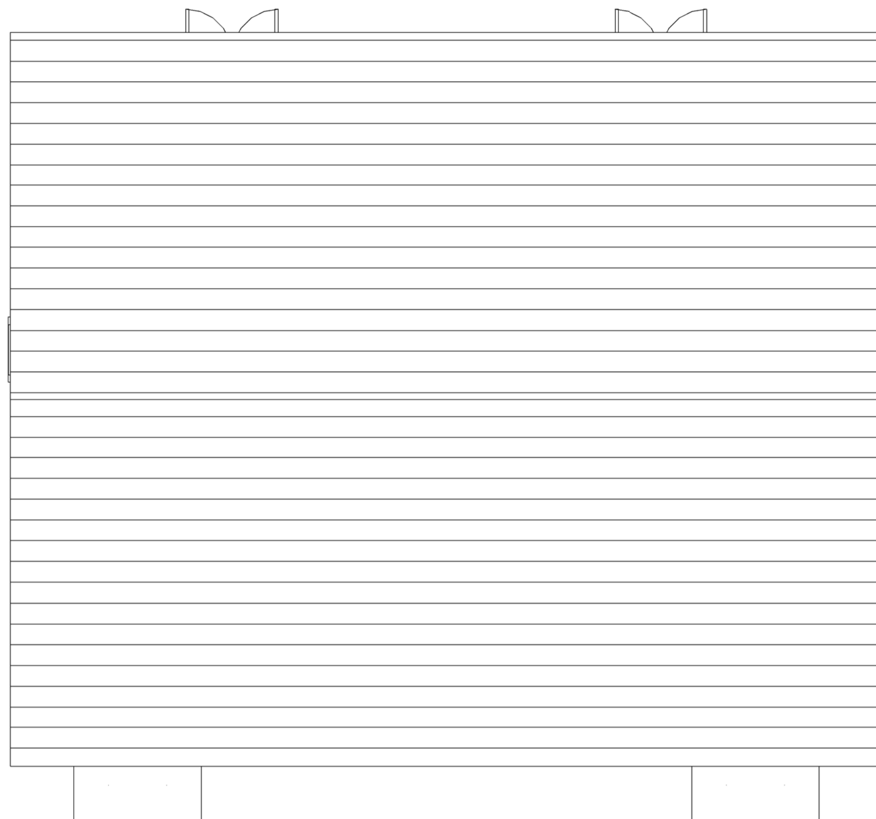
3 Roof Plan 1 : 50