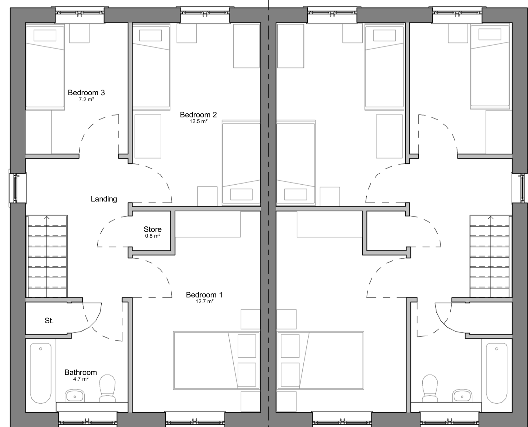
2 First Floor - GIA 48.7 m2 1 : 50

RESPONSIBILITY IS NOT ACCEPTED FOR OTHERS SCALING DIRECTLY FROM THIS DRAWING. DO NOT SCALE FROM THIS DRAWING. USE WRITTEN DIMENSIONS ONLY.