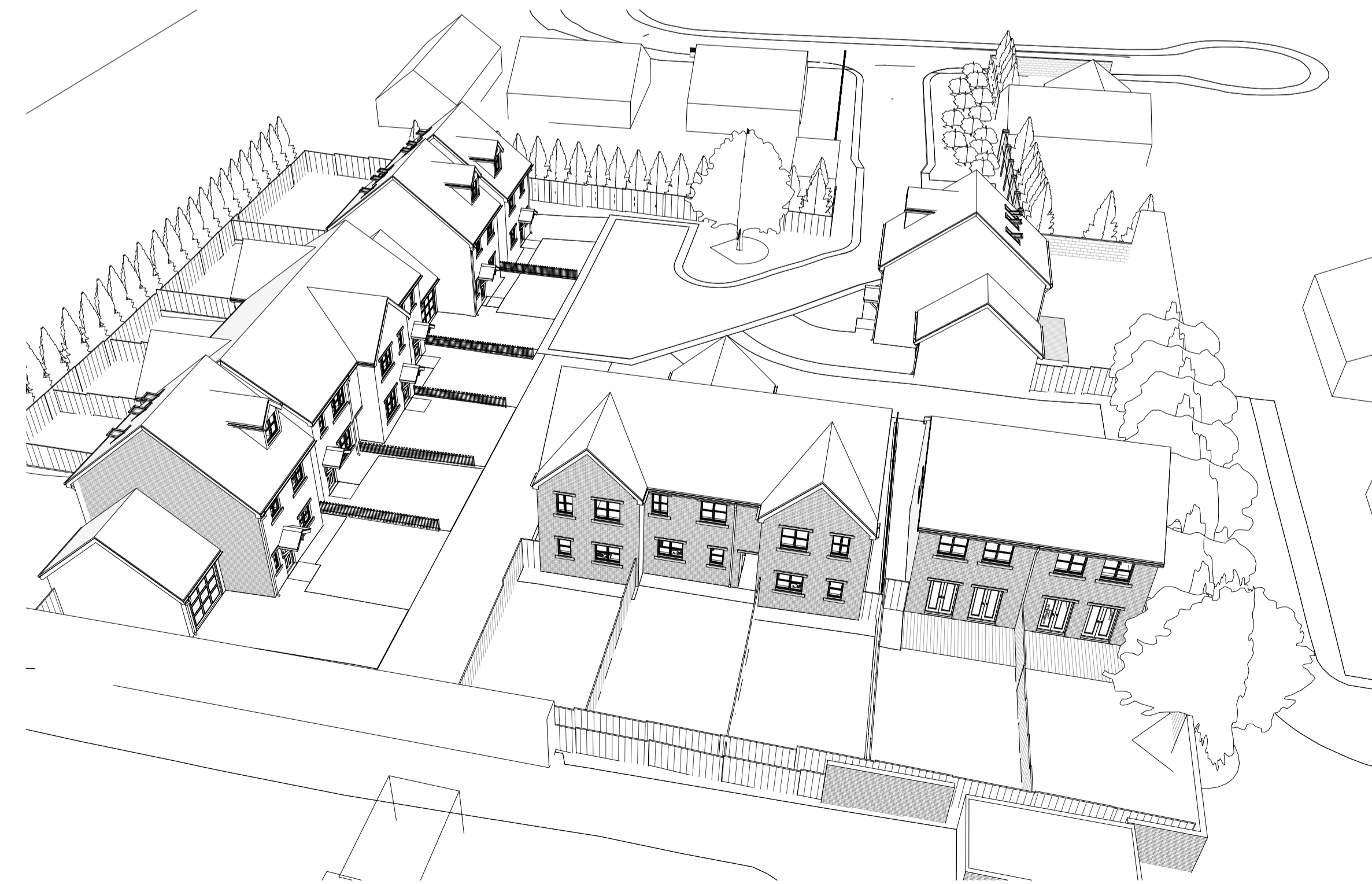
3D View 5