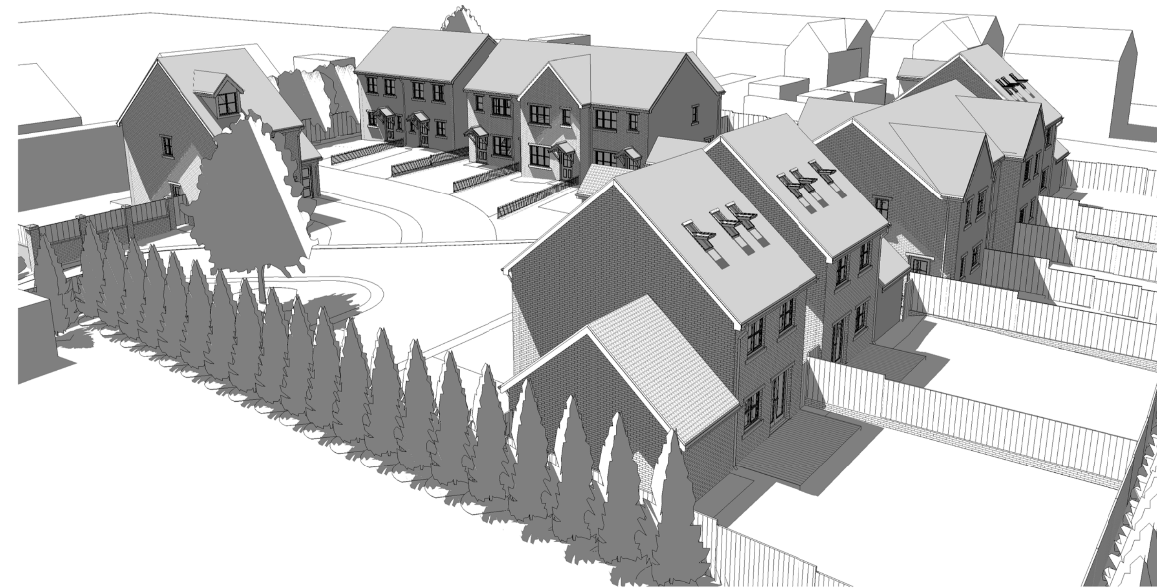
3D View 6