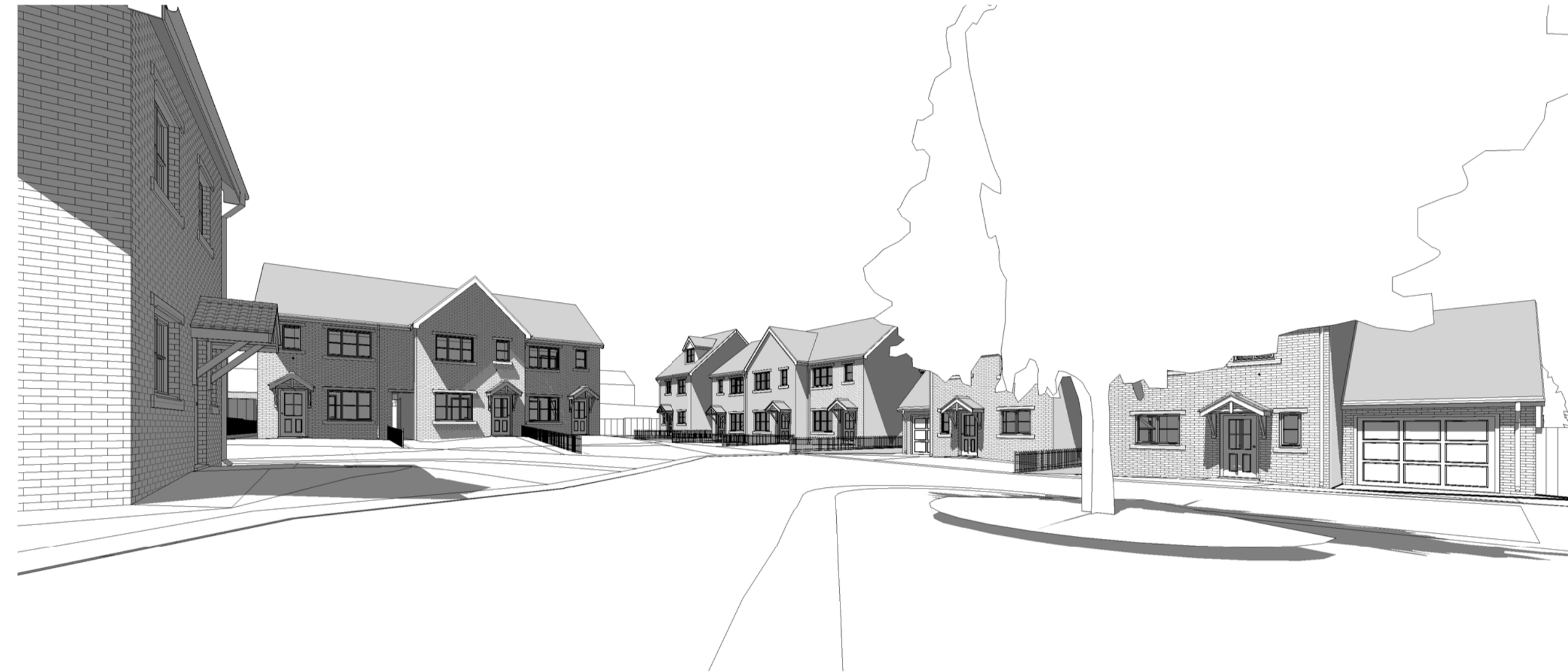
3D View 4