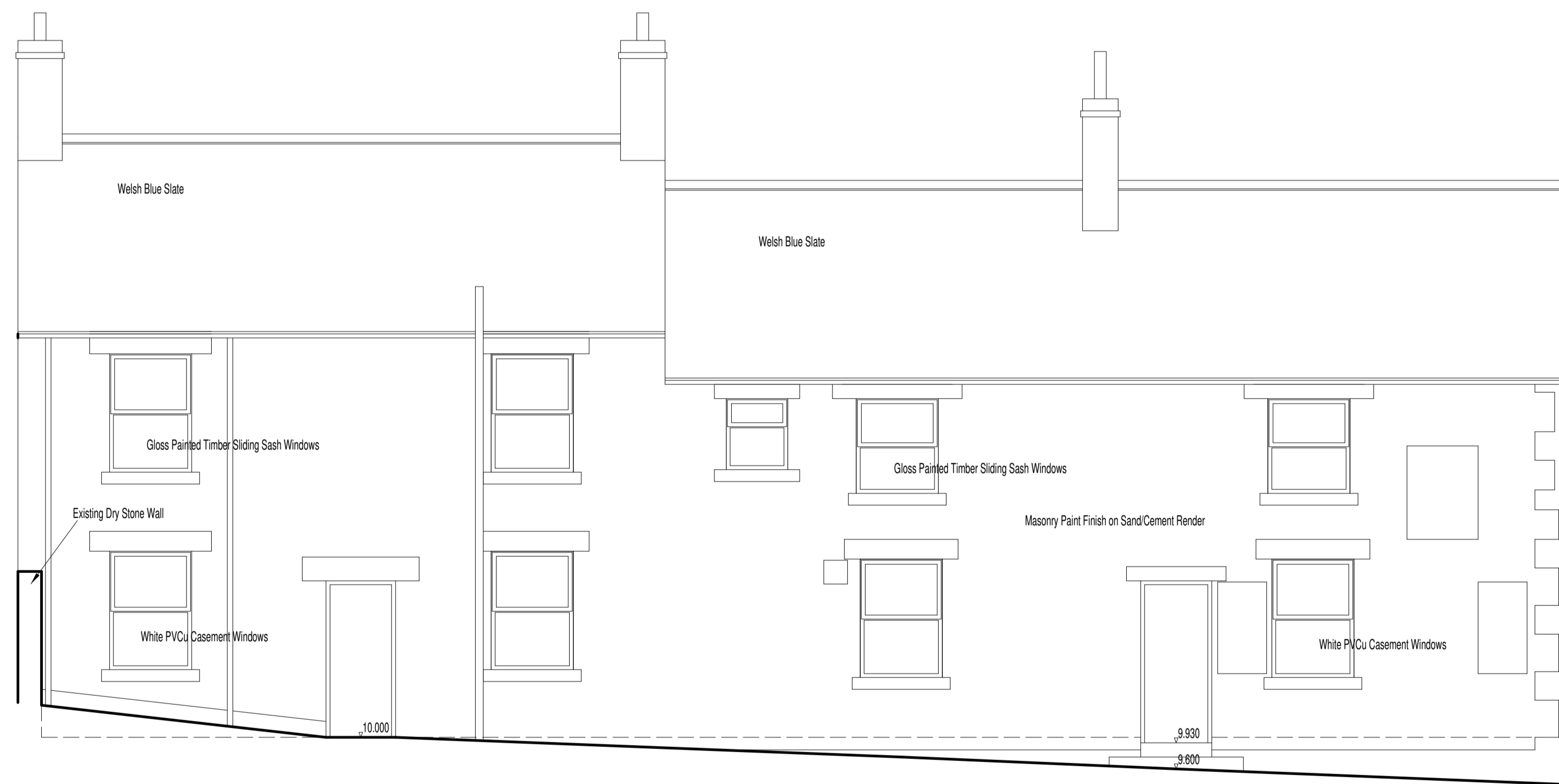
Front (East) Elevation (A) to Barnsley Road as Existing

External Signage and Lighting Subject to Separate Consent to Advertisement Application