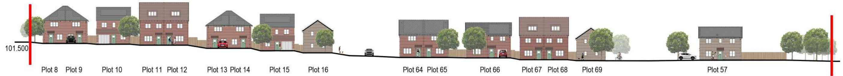
Section B 1:500