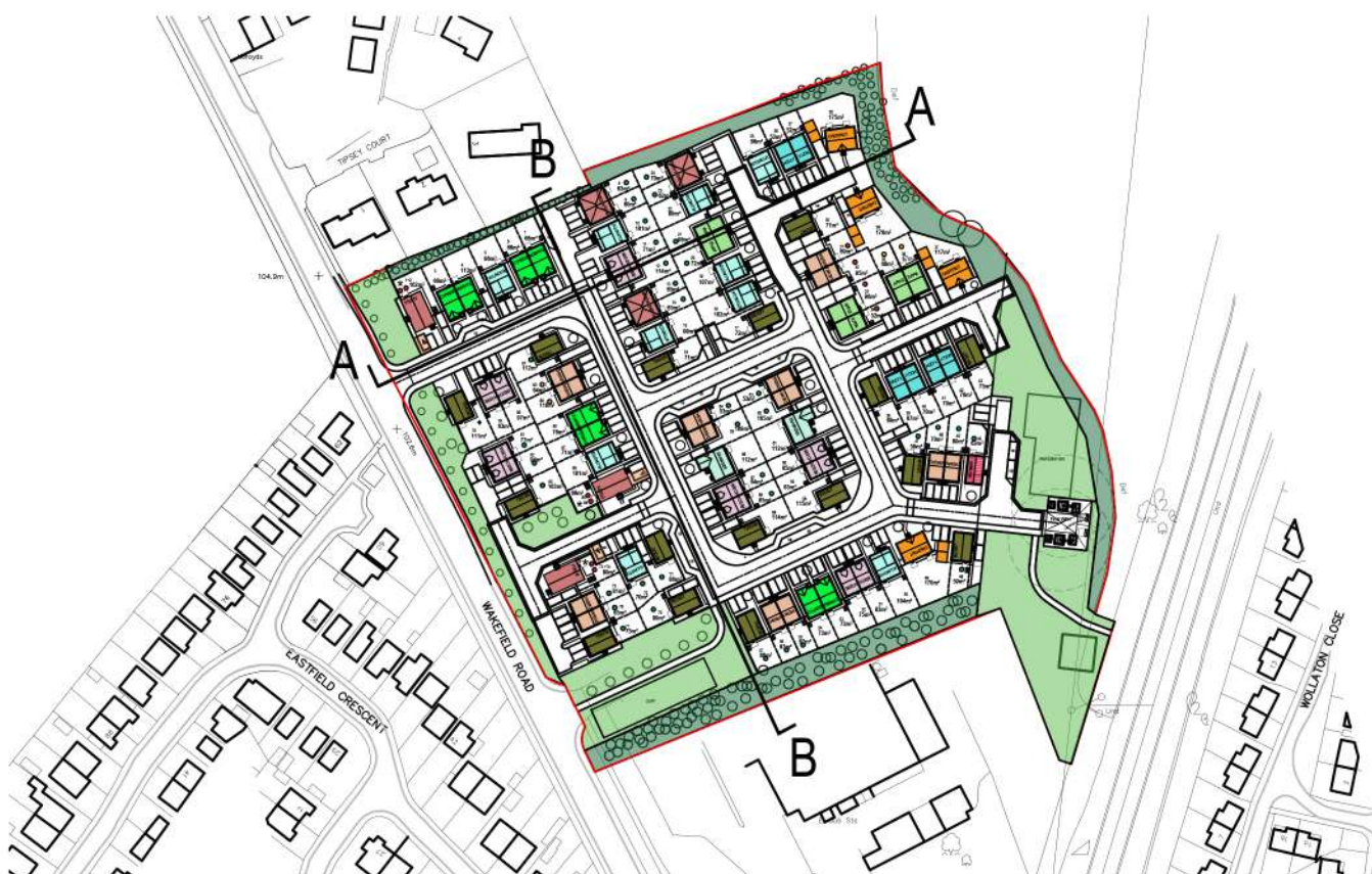
Site Plan 1:1250