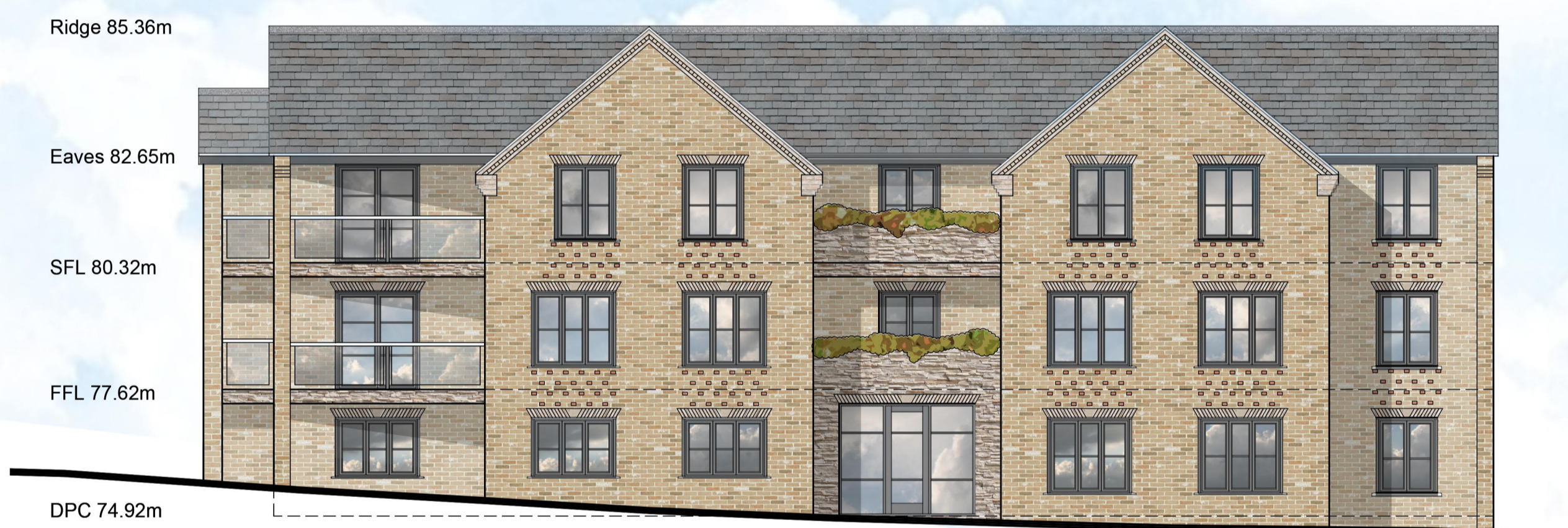
WEST STREET ELEVATION