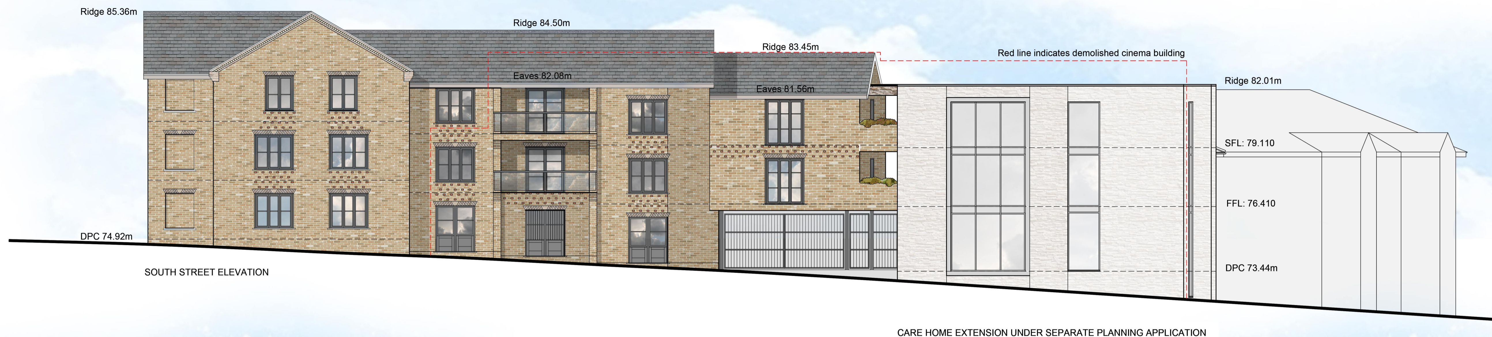
SOUTH STREET ELEVATION

NOTES This drawing has been issued in support of a planning application and must NOT be used for construction purposes. This drawing is copyright and may not be altered, traced, copied, photographed or used for any purpose other than that for which it is issued without written permission from the copyright holder.