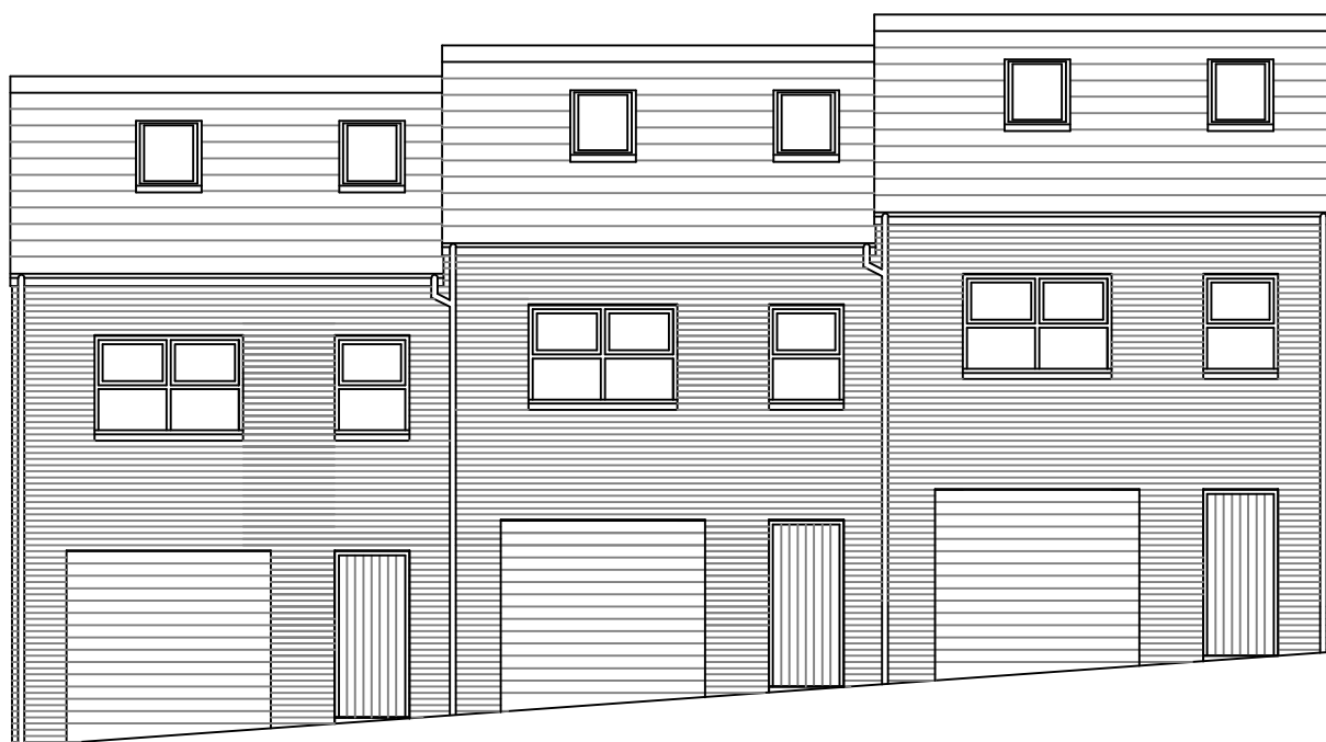
WEST ELEVATION – TO POND STREET