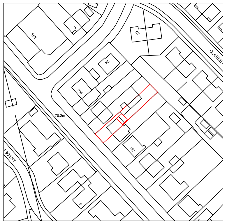
LOCATION PLAN SCALE 1:1250 AT A3