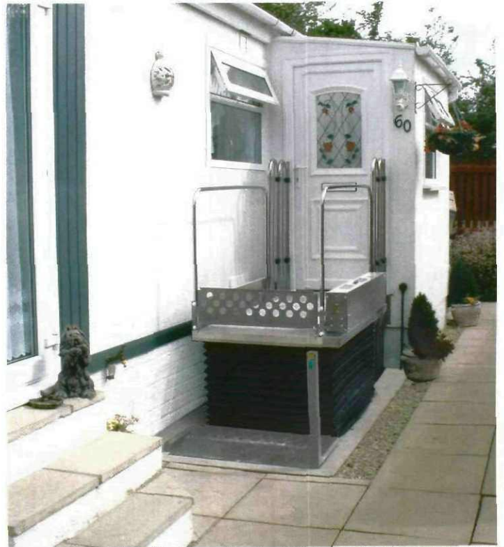
TSL 1000 with double step bridging unit in line with door way