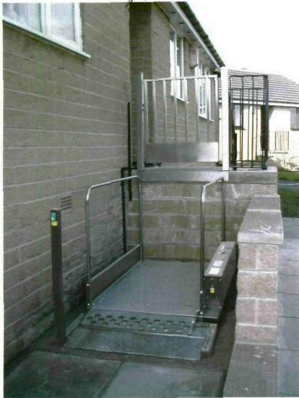
TSL 1000 with upper level gate

The Terry STEPLIFT 1000 is the ideal solution to wheelchair access problems in domestic situations