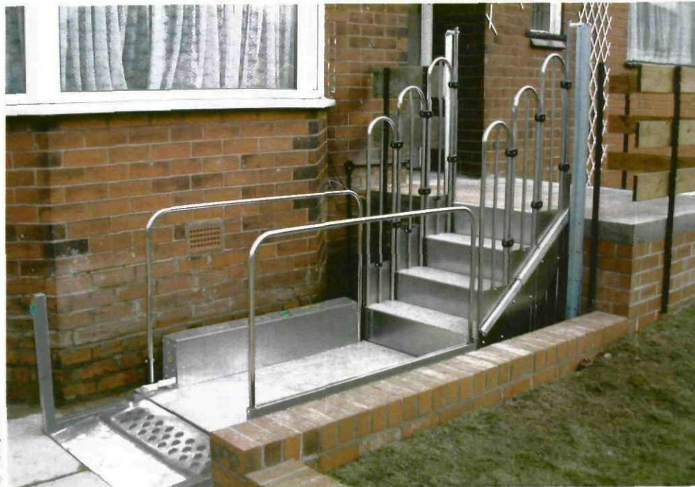
TSL 1000 with triple step bridging unit and upper level landing