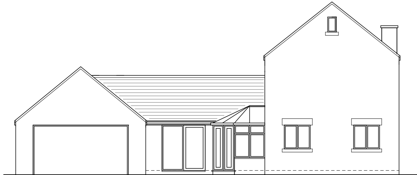
left side (south) elevation