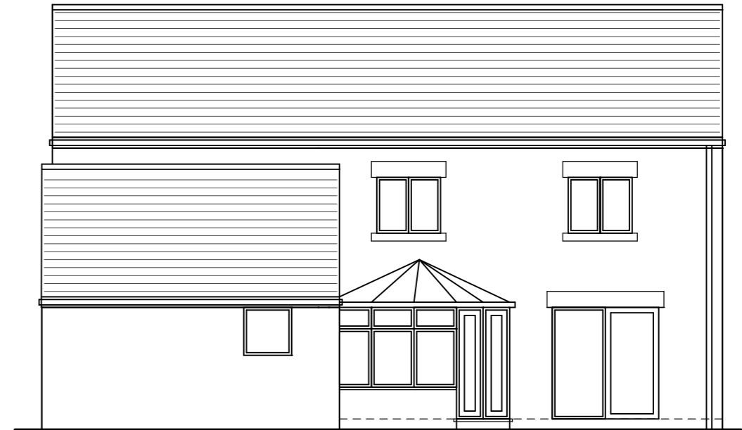
rear (west) elevation