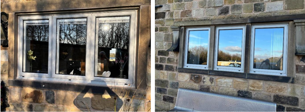
Main house external windows and colour example.

Aluminium Papyrus Grey to match main house