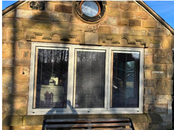
Main house external door and colour example.

Aluminium Papyrus Grey to match main house