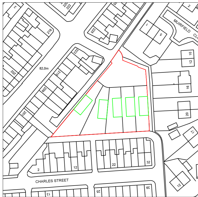
LOCATION PLAN SCALE 1:1250 AT A3