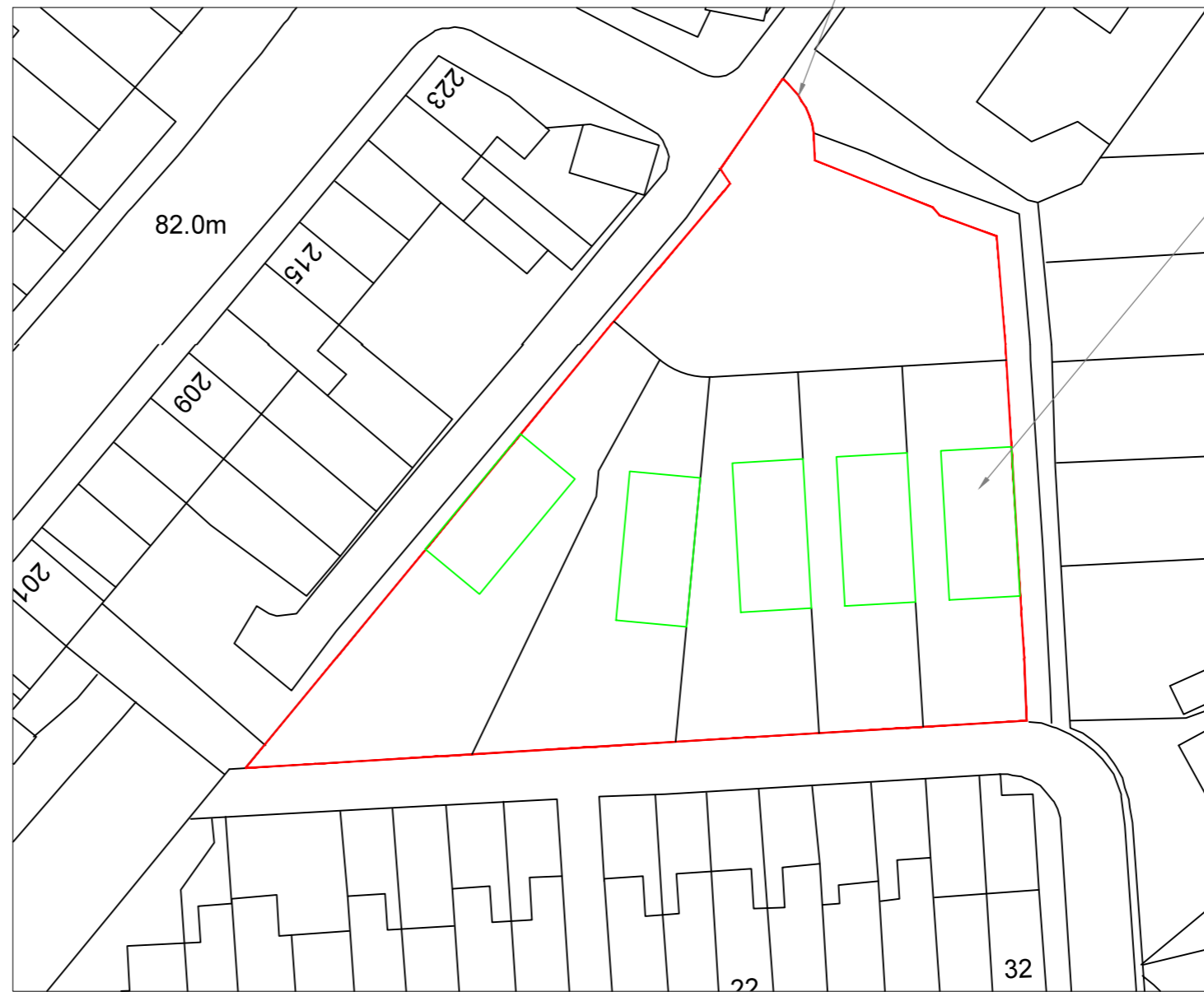
SITE PLAN SCALE 1:500 AT A3

PROPOSED DETACHED DORMER BUNGALOWS EACH AREA 68m 2