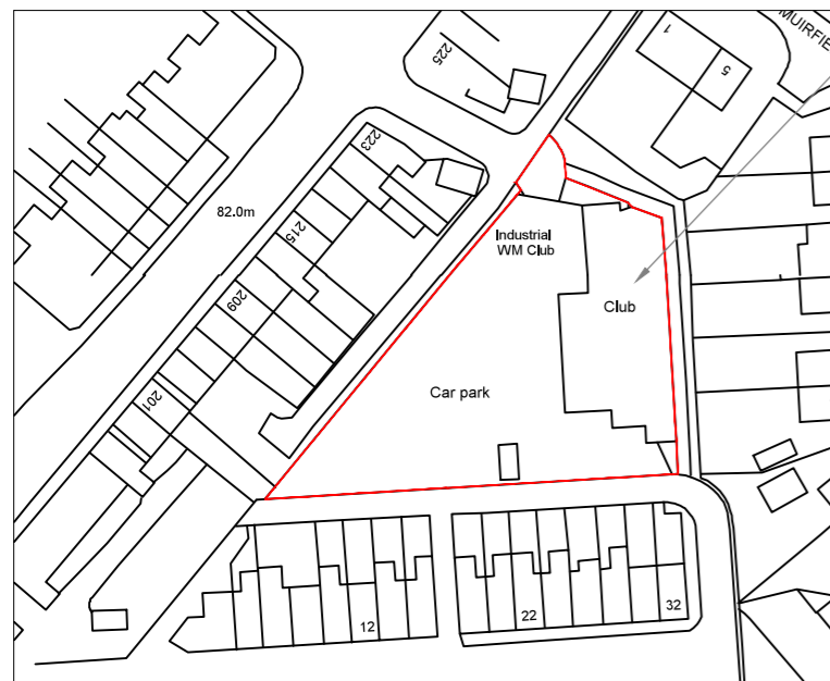
LOCATION PLAN SCALE 1:1250 AT A3