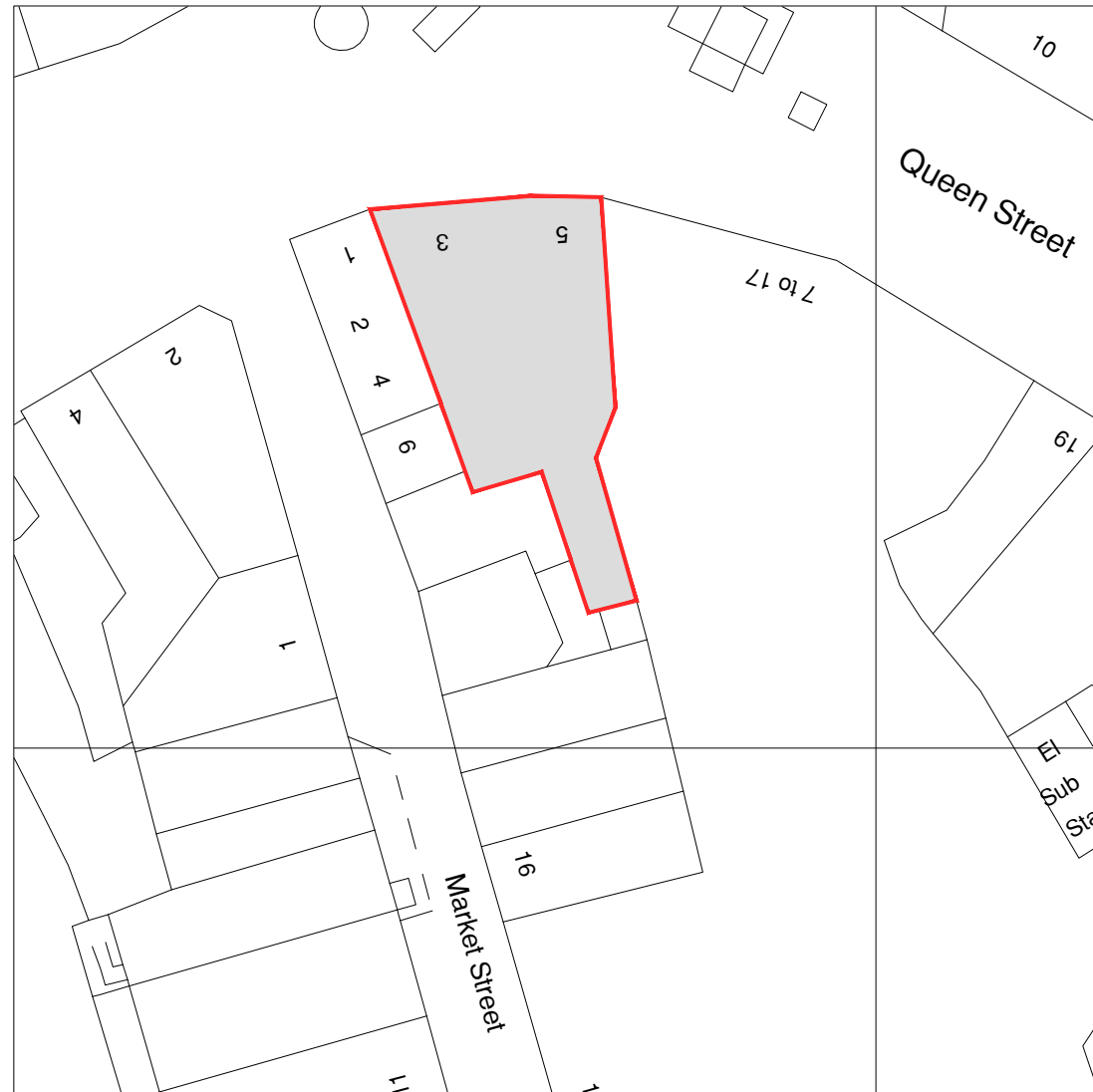
Block Plan @ 1:500 @ A3