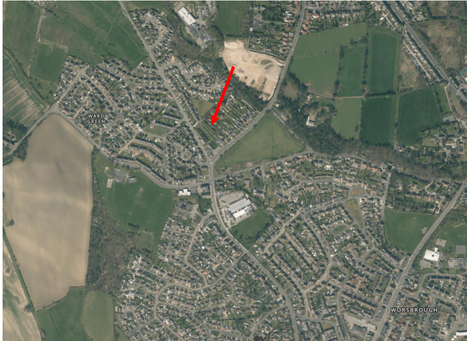
3.2.2. The site is an area of grassland between the houses., shown on the aerial map below, shaded in yellow.