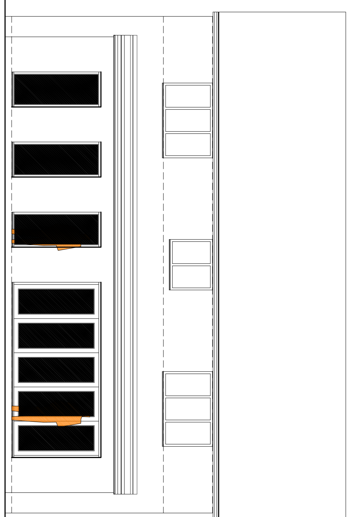
1:50 PROPOSED SOUTH ELEVATION