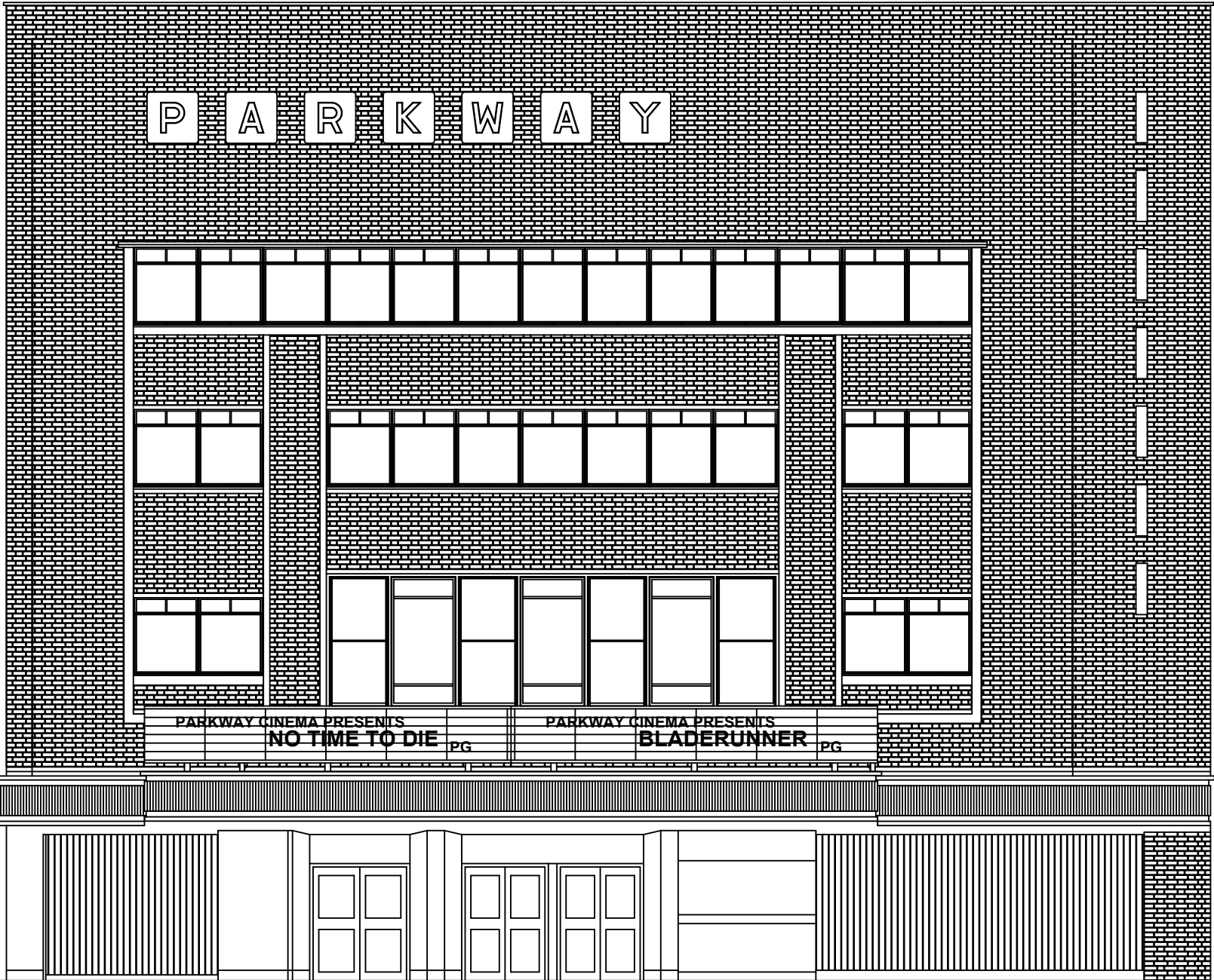
PROPOSED ELDON STREET ELEVATION