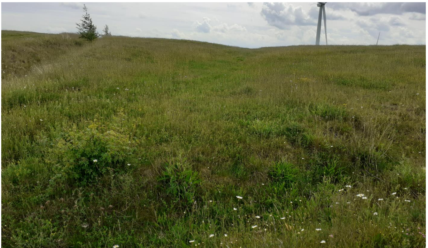
Plate 6: Shallow depression extending from the northern end of the ditch pictured above, in a south-easterly direction (to also receive some of the estimated 75 marsh orchids)