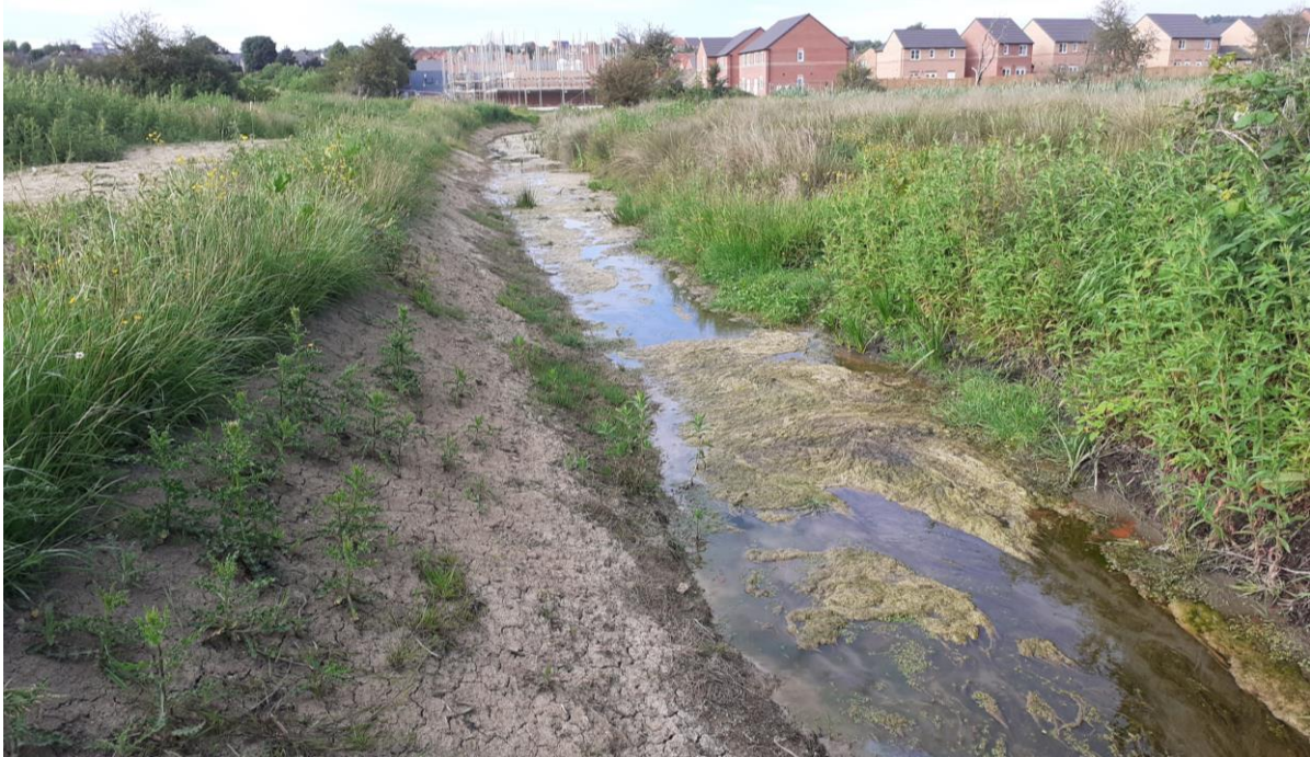
Plate 7: Flat Moor Dyke (looking north towards Phase 2 of the Barnburgh Lane development) taken in June 2021

Pond P1, located a short distance to the south-east of the site, tested negative for traces of DNA; Flat Moor Dyke yielded an ‘indeterminate’ result on both occasions, due to precipitate in the water, but was noted to contain a large number of sticklebacks, making it generally unsuitable for GCN. The other ponds referred to by Wildcare in their correspondence were searched for but found to be either dry, or simply no longer present, on the 1 st of June 2021. Great crested newt, therefore, does not pose a potential constraint to development.