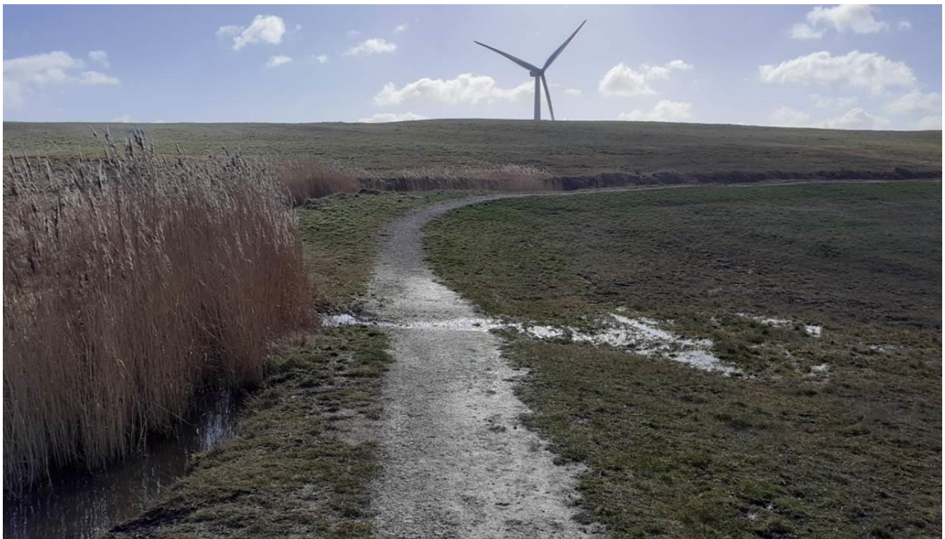
Plate 2: View of overflow feeding Orchid Receptor Area 1 (0.17ha), due to be 'formalised' and made permanent.