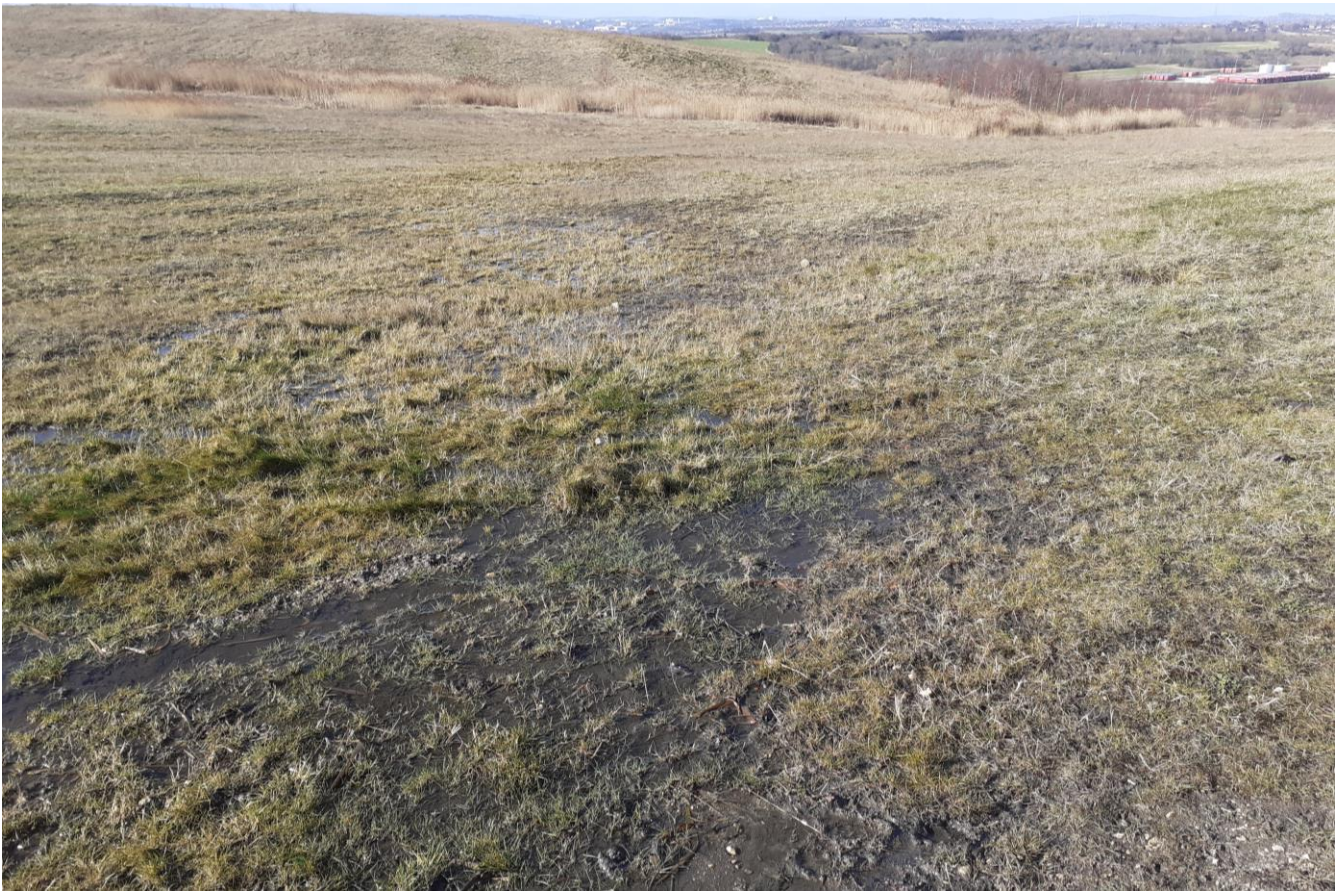
Plate 1: View of Orchid Receptor Area 1 (0.17ha), due to receive 100 marsh orchids.