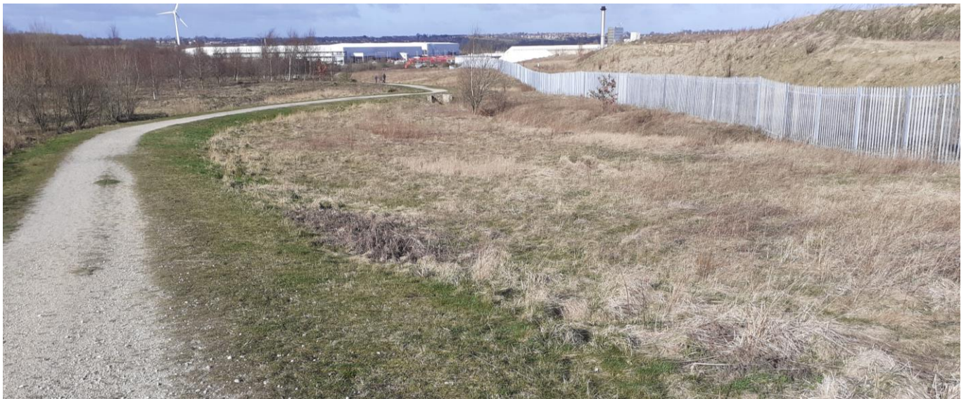
Plate 3: View of Receptor Area 2 (to the right of the footpath), due to receive common spotted orchids.