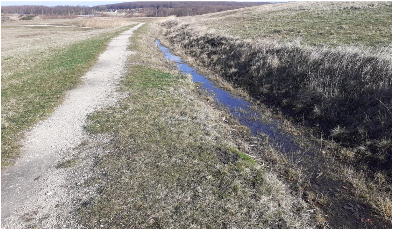
Plate 5: Receptor Area 4, a 180 metre long ditch on fairly level ground, due to receive circa 75 marsh orchids.