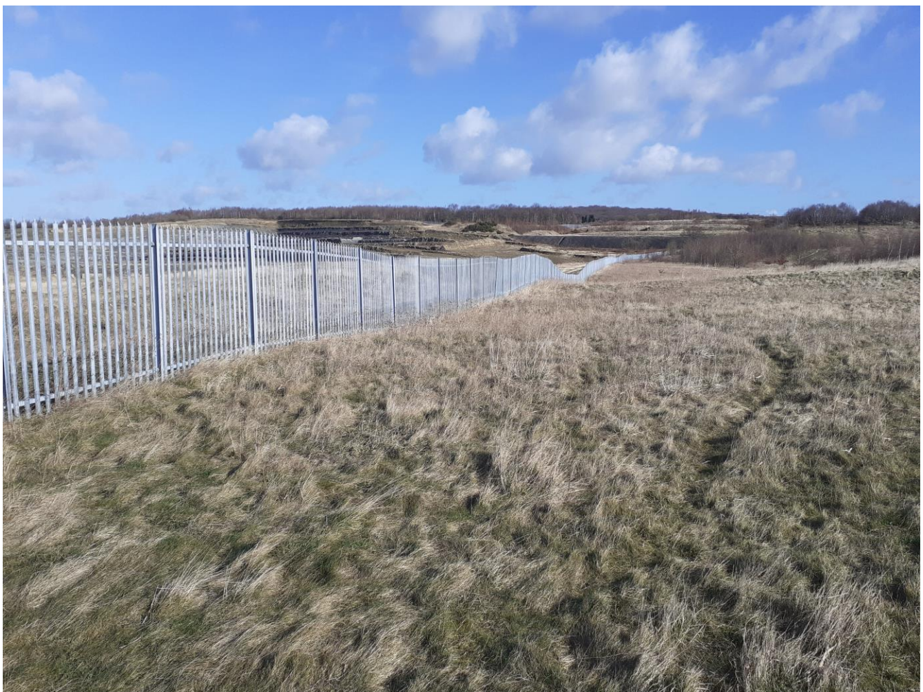
Plate 4: View of Receptor Area 3 (0.12ha), due to receive 75 marsh orchids.