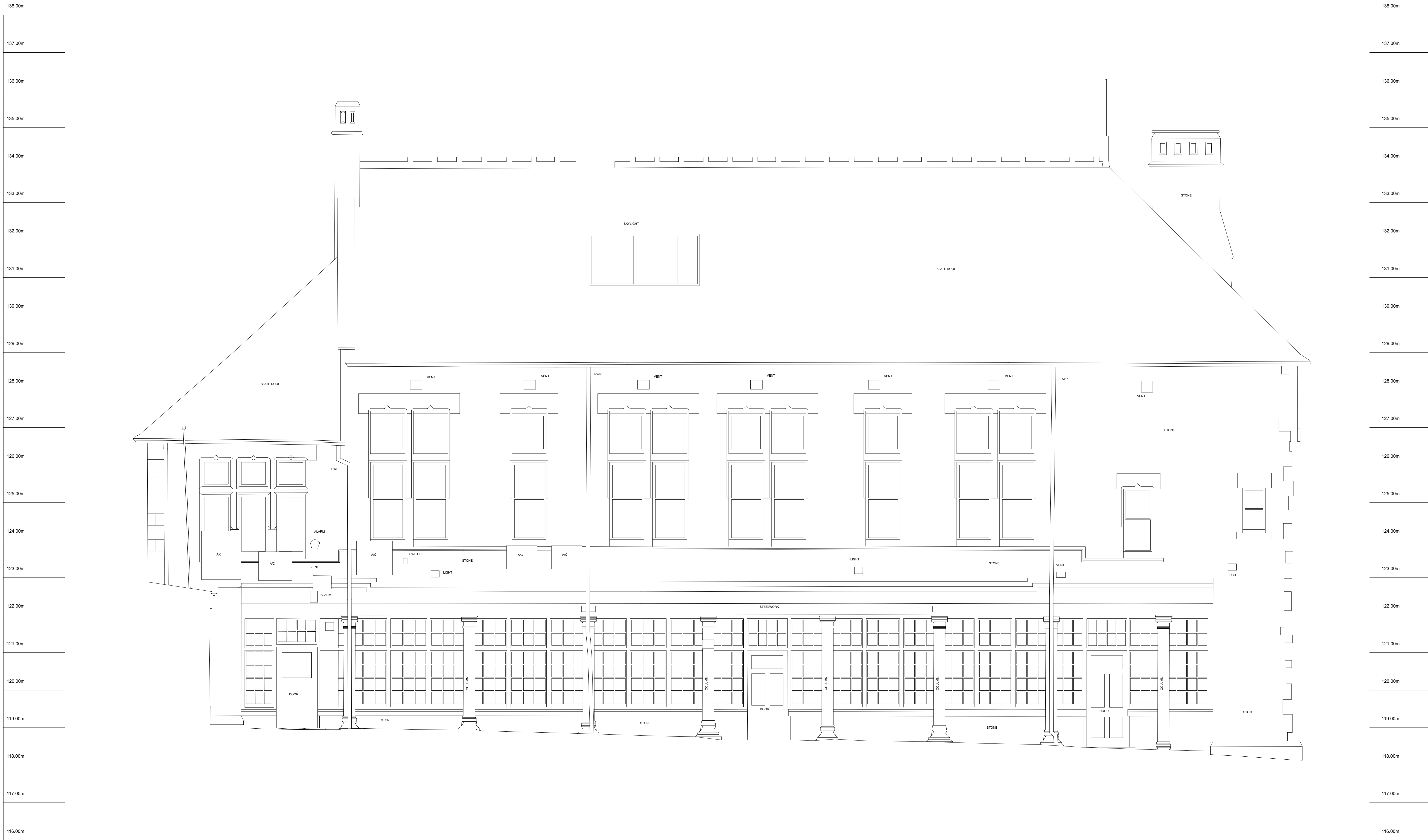
Existing West Elevation 1:50