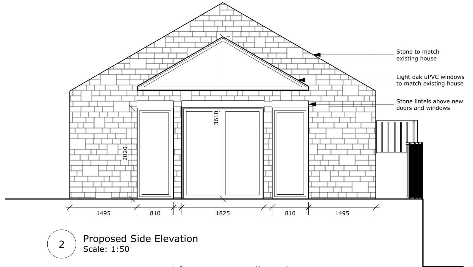
2 Proposed Side Elevation Scale: 1:50