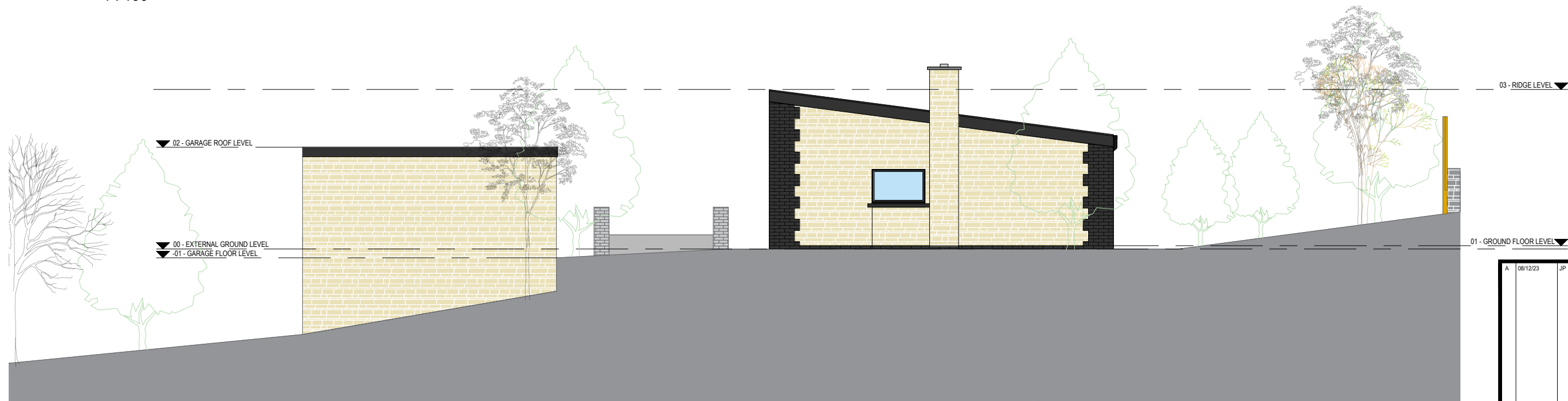
Existing Left Elevation 1 : 100