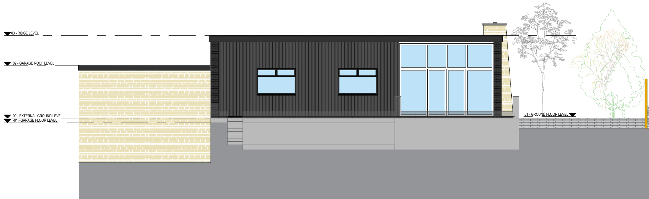
Existing Rear Elevation 1 : 100