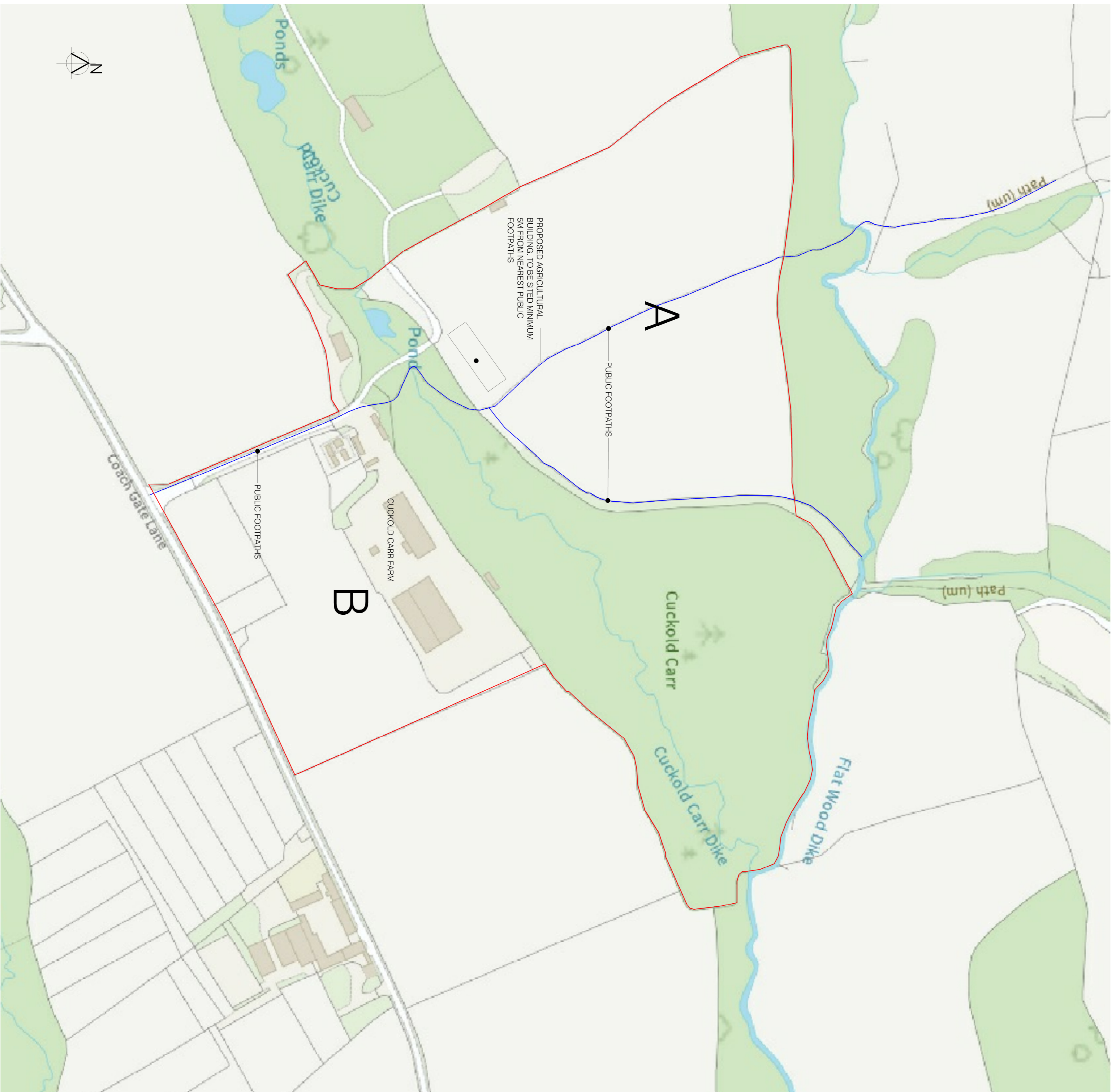
SITE LOCATION 1:1250