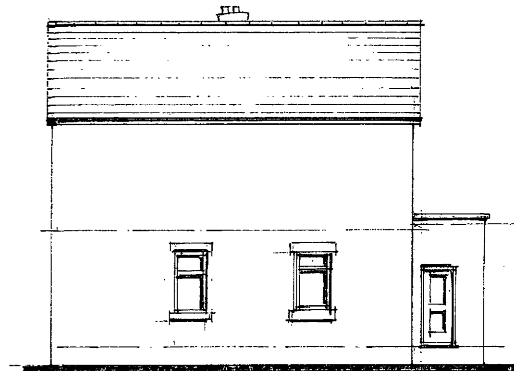
Existing Side Elevation On 1