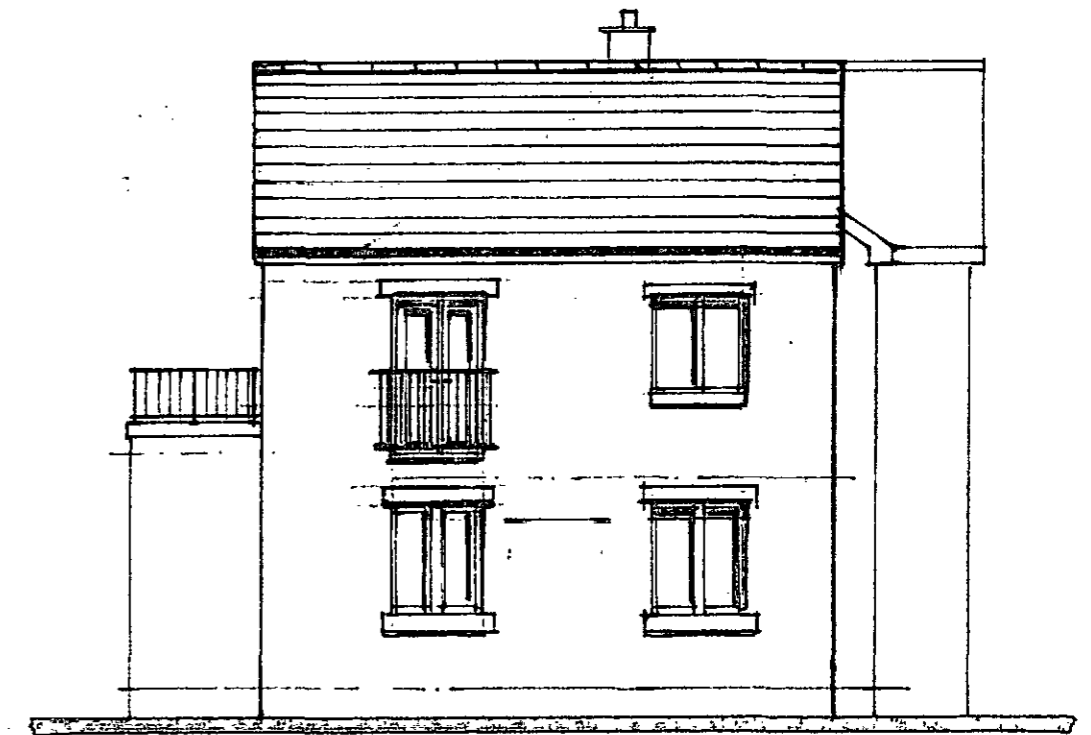
Proposed Side Elevation On 2