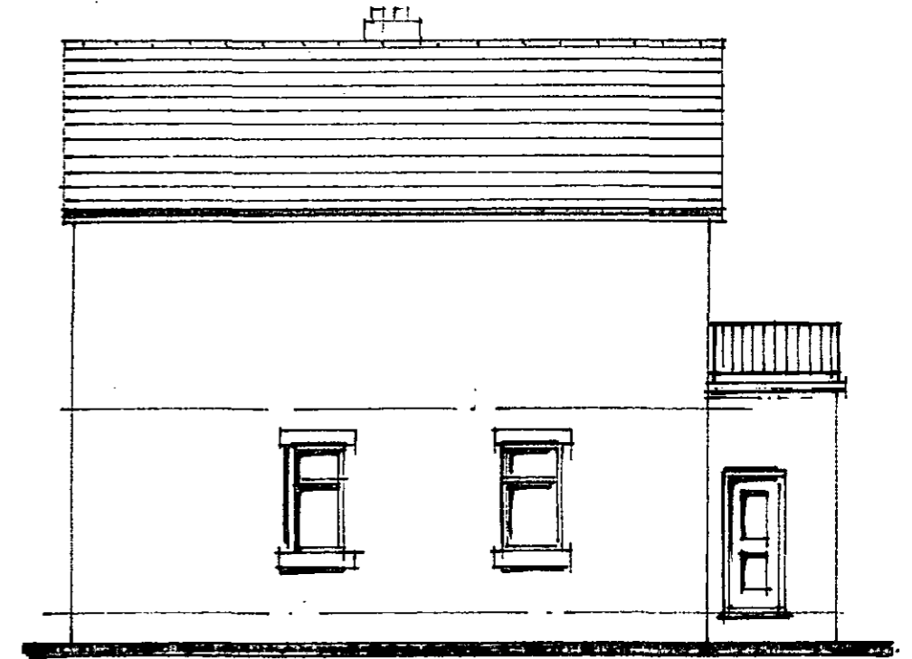
Proposed Side Elevation On 1