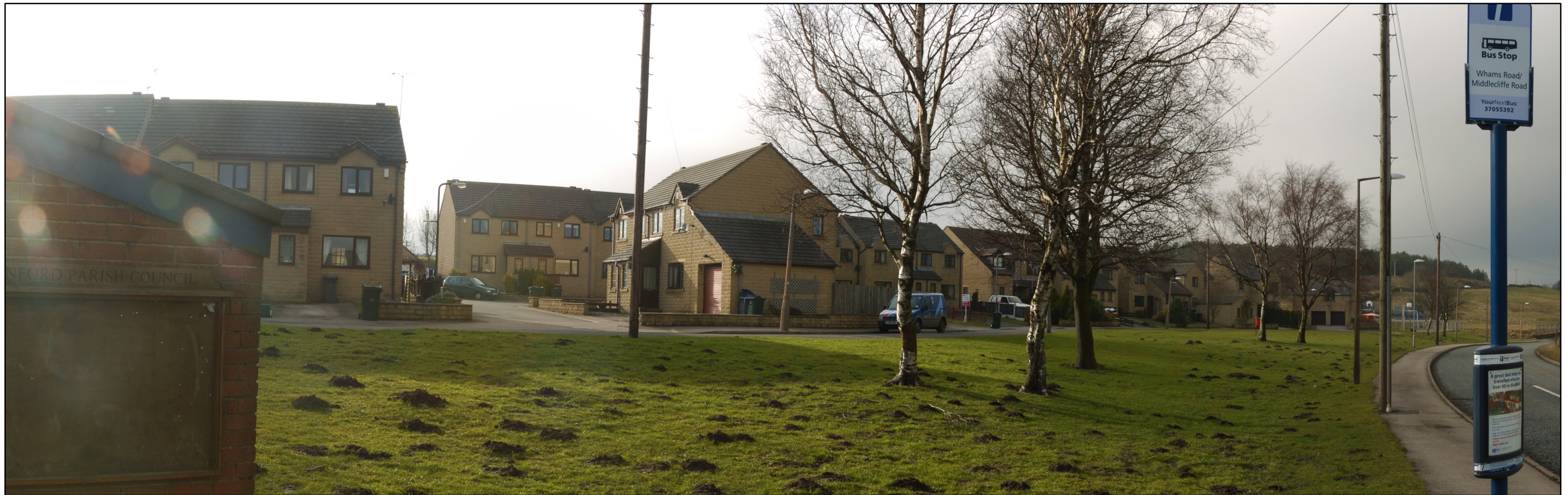
Existing view from viewpoint