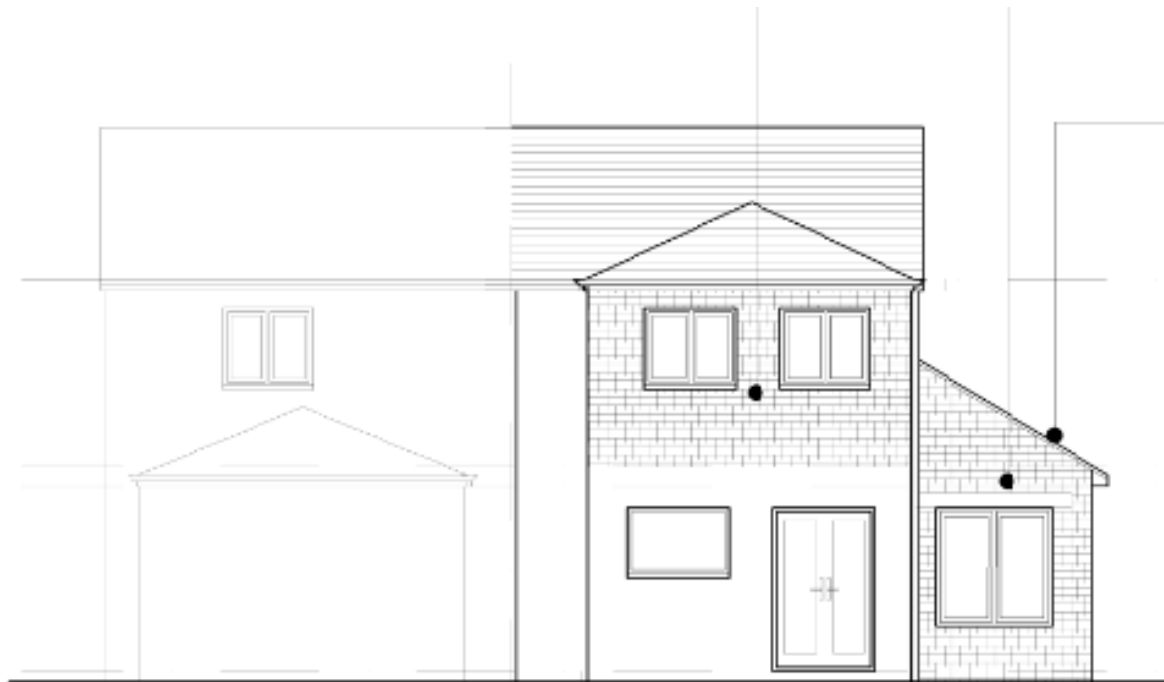
REAR ELEVATION AS PROPOSED 1:100

As can be seen on the drawing below the first-floor window to the adjacent dwelling is set a distance away from the proposed first floor extension by approximately 3.5m. The proposed extension would have a limited projection of 3m which is in line with the guidance set within the SPD. Given the above it is not felt that there would be any significant overshadowing or overbearing impact from the proposed two storey extension, in order to warrant a refusal of planning permission on this basis.