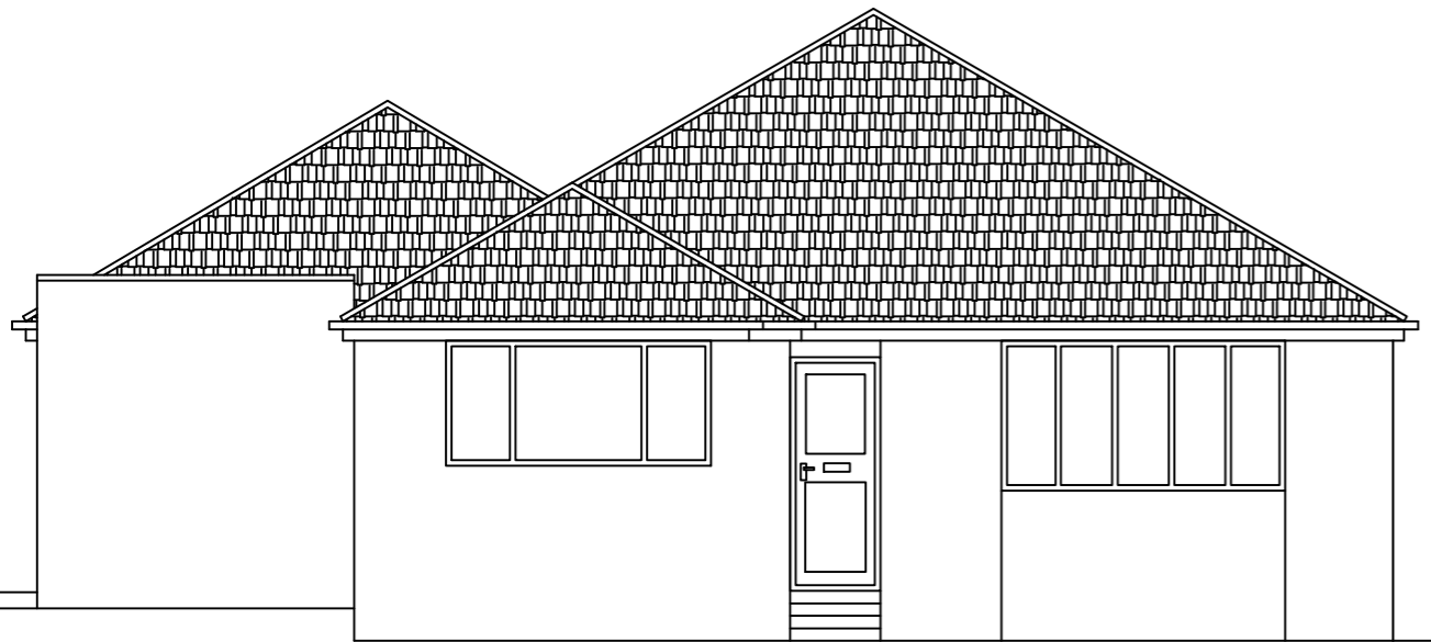
PROPOSED FRONT ELEVATION SCALE 1:100 AT A3