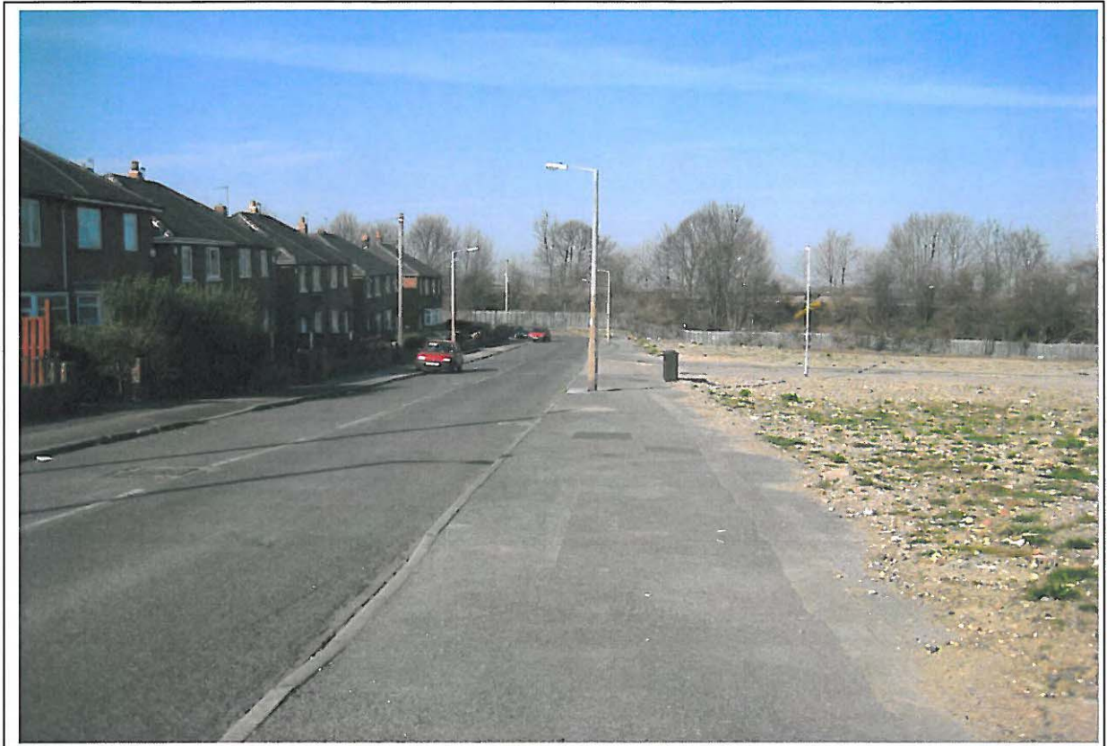
PHOTOGRAPH 7-View down Raymond Road