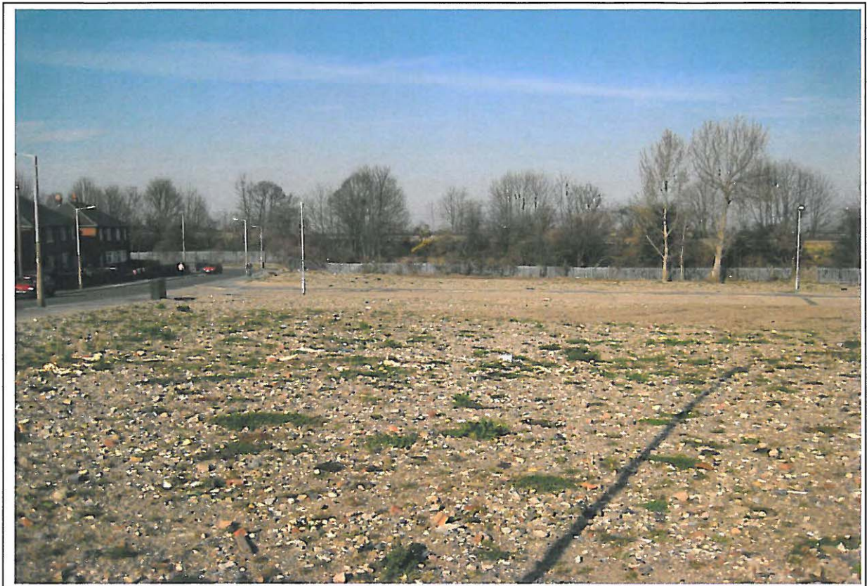
PHOTOGRAPH 3-Low spot against rail embankment in NE corner