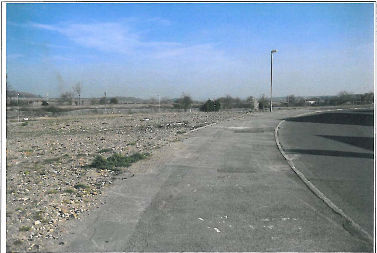
PHOTOGRAPH 8-View across site looking east