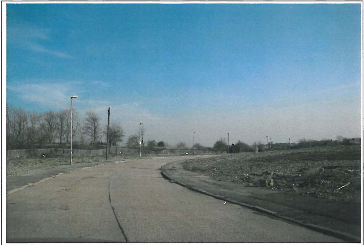
PHOTOGRAPH 1-Leslie Road looking East