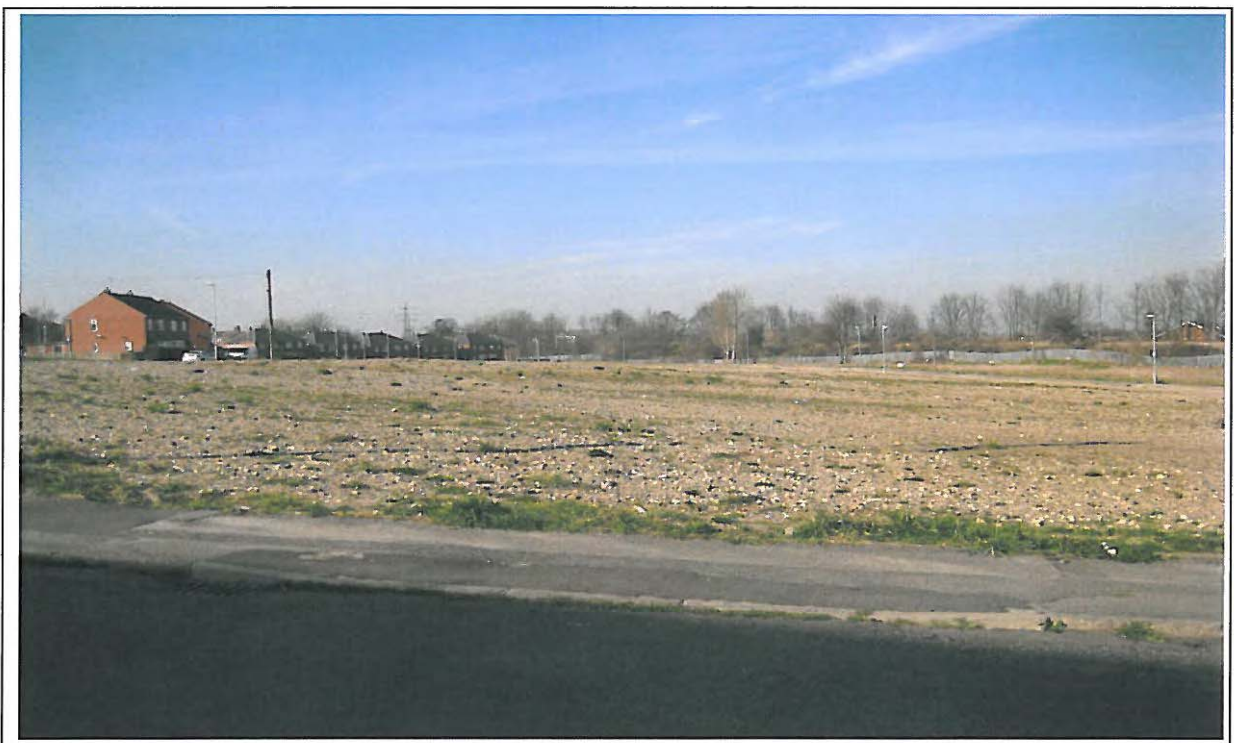
PHOTOGRAPH 4-View from site looking East