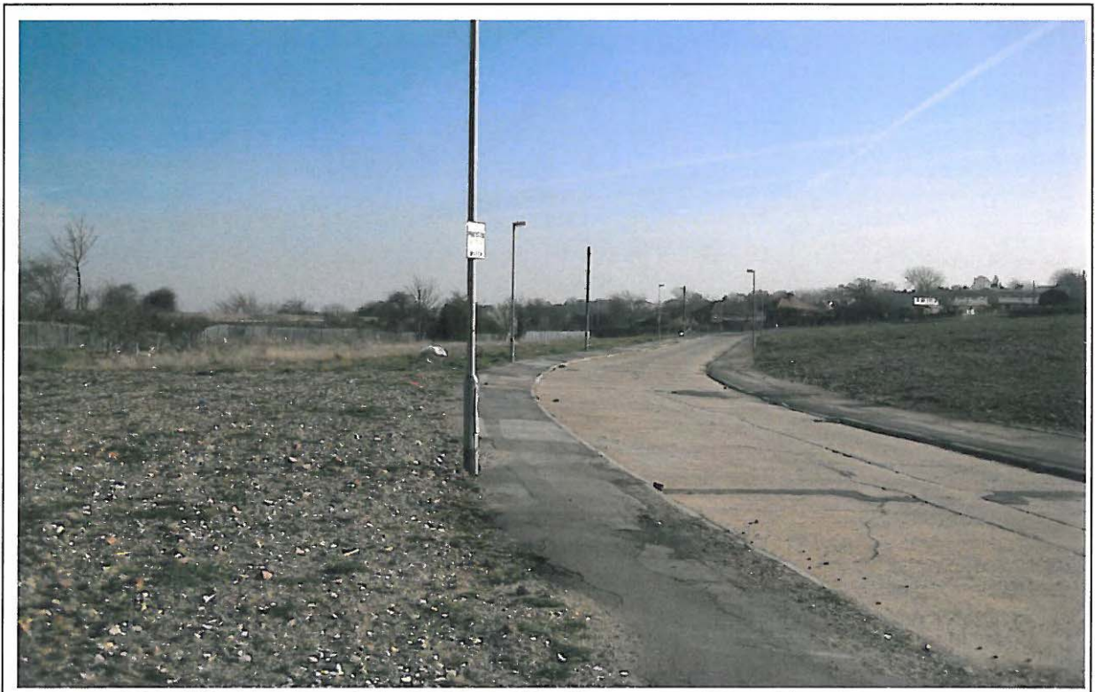
PHOTOGRAPH 2-Low spot n Leslie Road