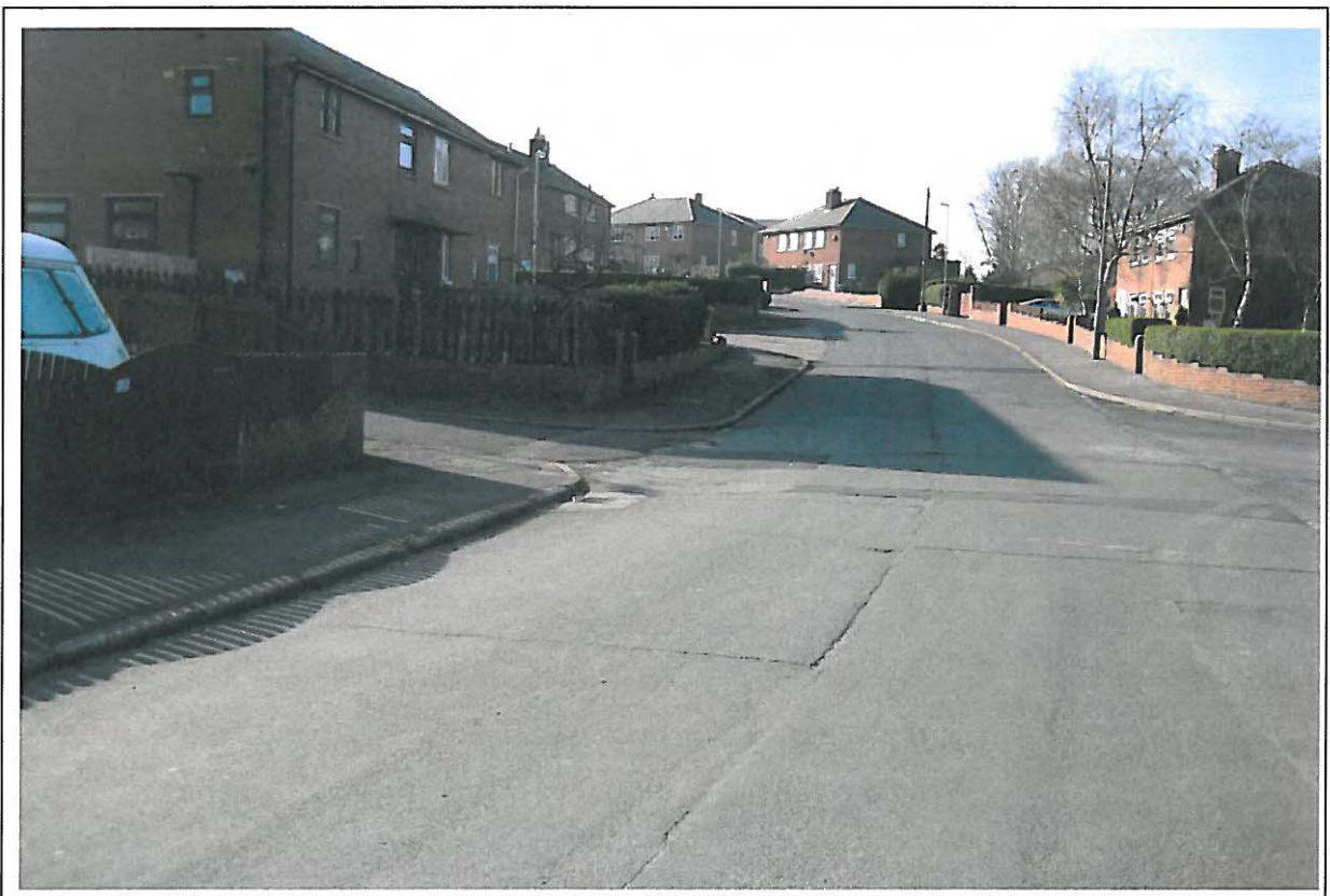
PHOTOGRAPH 6-View towards Reginald Road