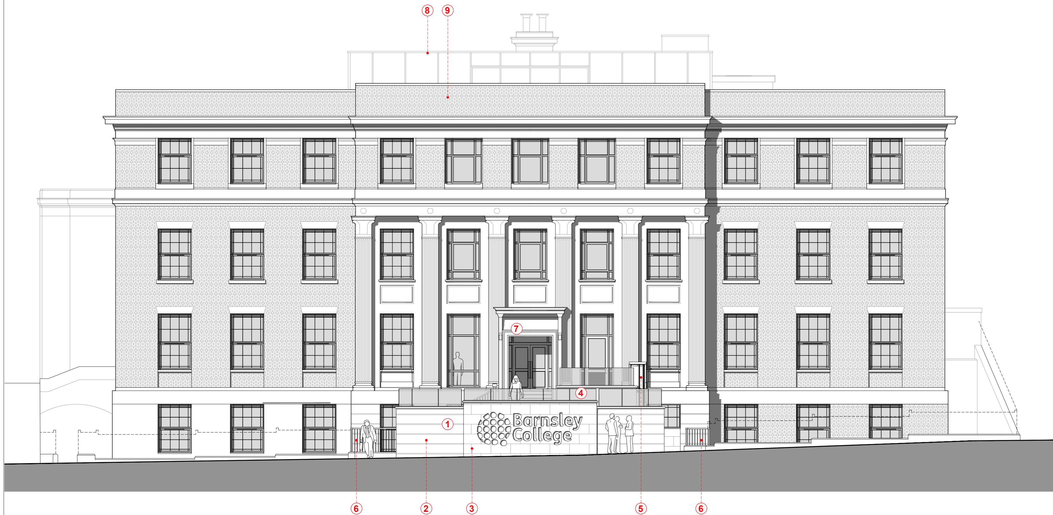
PROPOSED ELEVATION A (FRONT) 1:100 @ A2