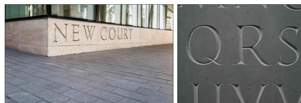
ABOVE: Sign precedents of carved logo / lettering in stonework