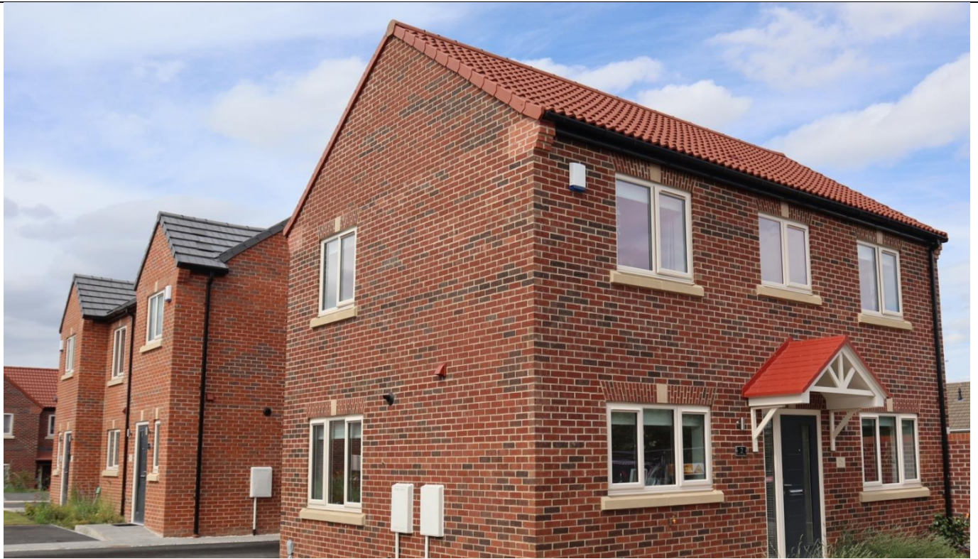
Typical Example of a Ben Bailey House Type