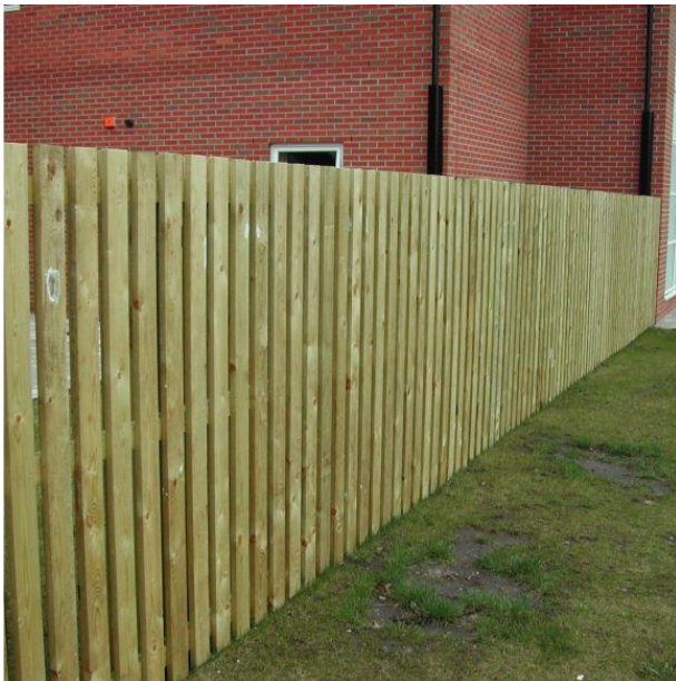
Timber hit and miss fence – 1.8m high between plot boundaries

Plot boundaries between each dwelling to received a timber screen fence as follows: