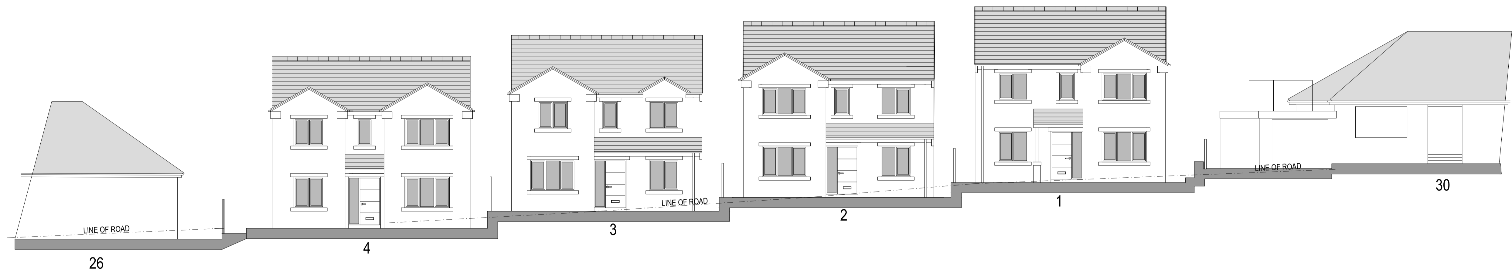
STREETSCAPE ALONG LOW CUDWORTH GREEN

IF IN ANY DOUBT PLEASE ASK THE ARCHITECT FOR CLARIFICATION. DO NOT SCALE FROM DRAWING. ALL DIMENSIONS TO BE CHECKED ON SITE. THE COPYRIGHT FOR THESE DRAWINGS REMAINS THE PROPERTY OF THE ARCHITECT. THEY MUST NOT BE REPRODUCED IN ANY WAY WITHOUT THE ARCHITECT'S PRIOR WRITTEN CONSENT.