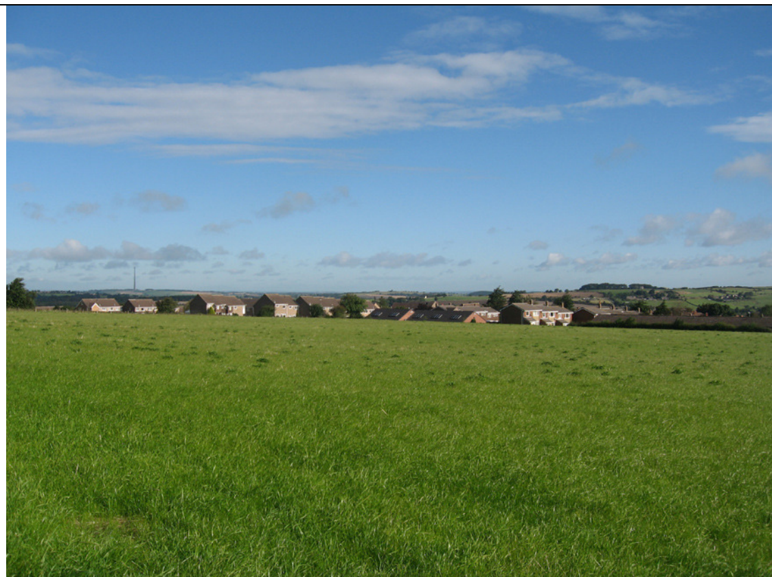
Photo 12: More recent residential scheme to the north east of the site