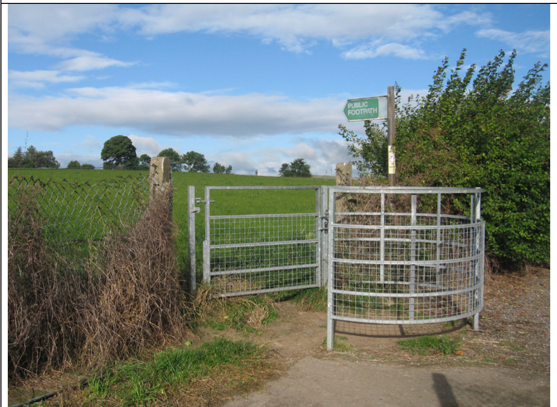
Photo 4: Kissing gate access to Public Right of Way crossing the site