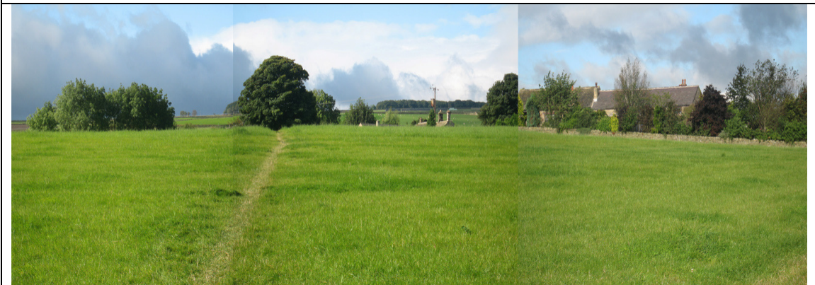
Photo 8: Looking north into the field beyond the site with Schole Hill to the right and Gravels in front (roof top and chimney visible only)