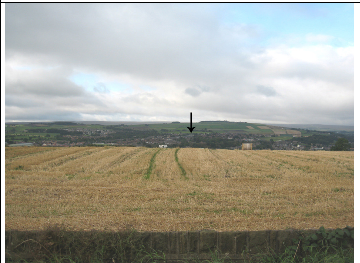
Photo 16: Looking towards Penistone from the A629. Position of site marked with arrow