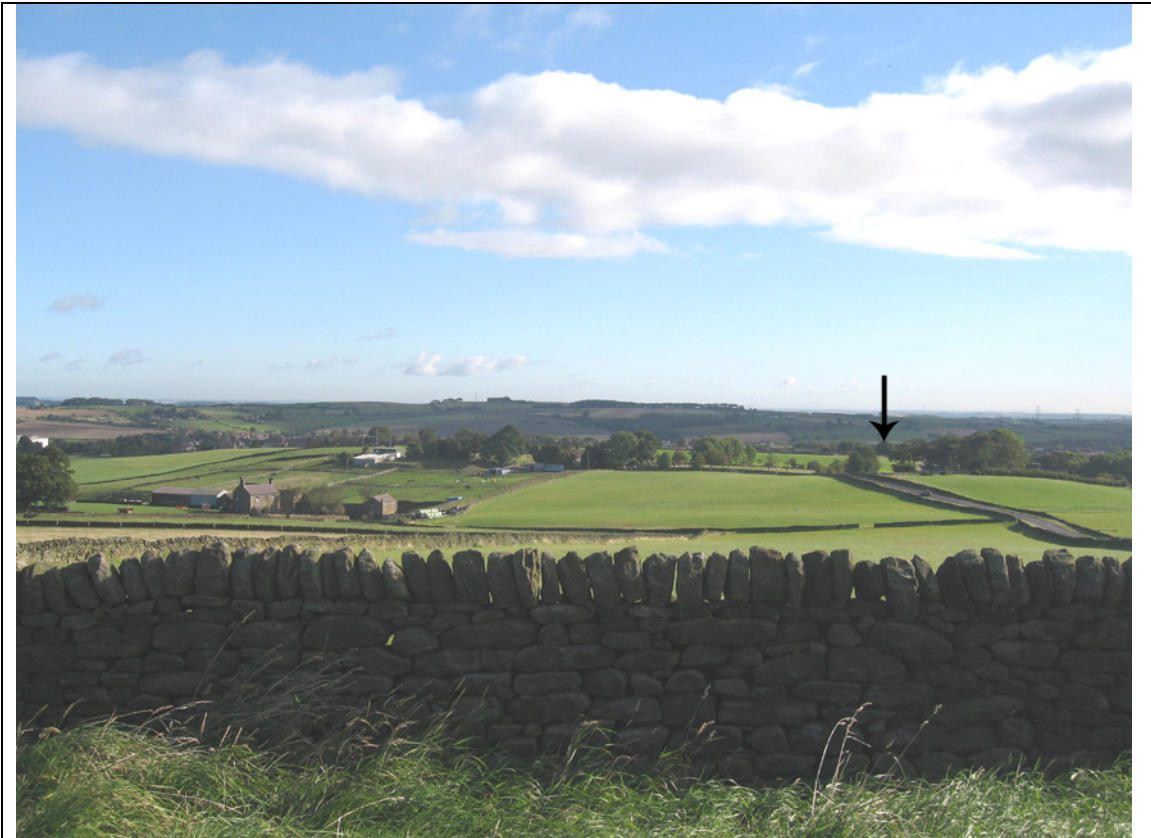
Photo 15: Looking towards the site from Cross Lane. Site sits downslope beyond the hedge and trees as shown