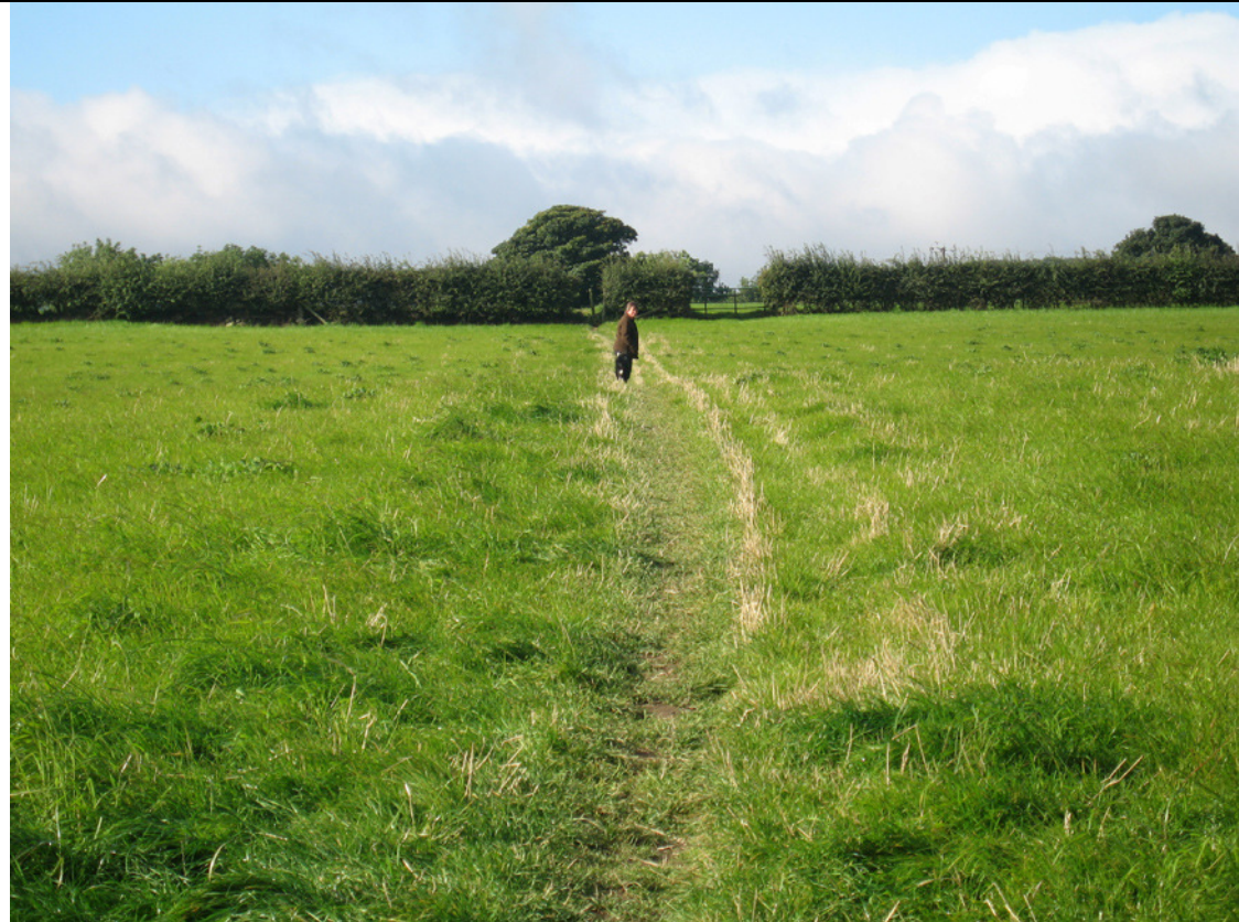
Photo 13: Public Right of Way crossing the site from north east to south west