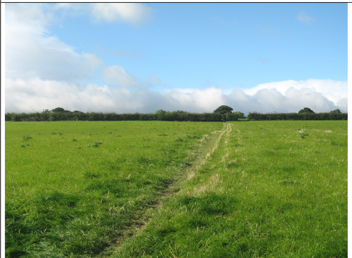
Photo 6: Looking towards the south eastern boundary and the mature native hedge on the boundary