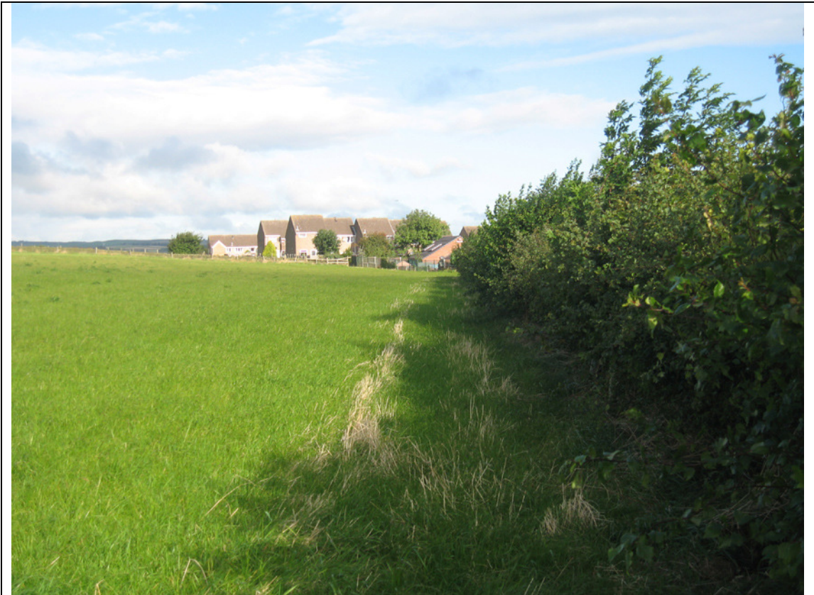
Photo 5: Northerly section of north eastern boundary with existing mature hedge and new houses in distance.