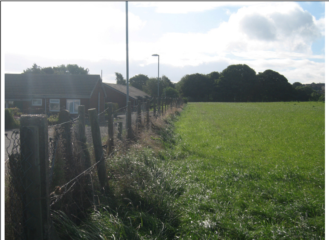
Photo 3: Post and wire fence to southern section of north easterly boundary