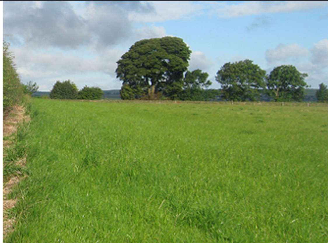
Photo 9: Looking towards the north western boundary wall with the track to Schole Hill and off site trees