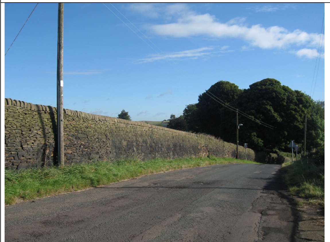
Photo 2: Existing stone boundary wall on Chapel Lane with copse of trees in adjacent garden at south east corner of site at the end of the road