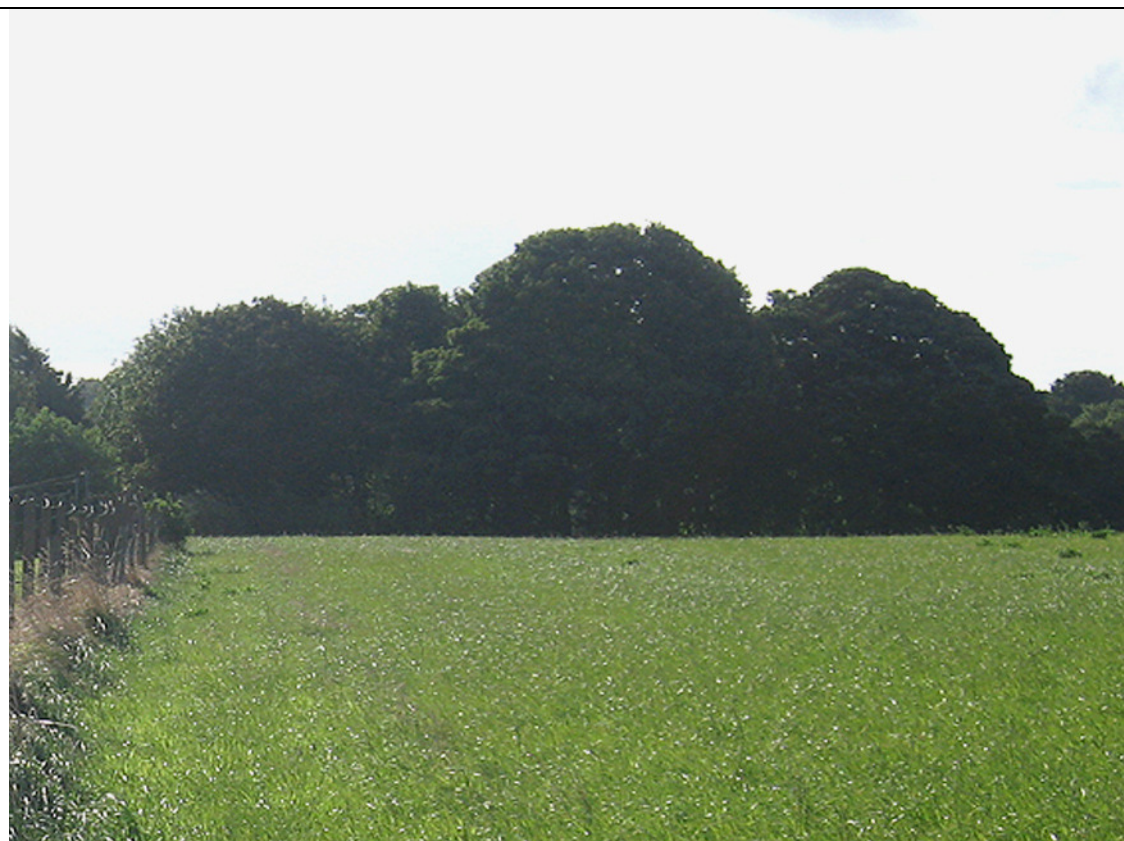
Photo 10: Looking towards copse of off-site trees in south eastern corner of the site