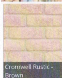
Cromwell Rustic - Brown

For the appearance of natural stone walling at an affordable price, Cromwell Stone Walling from Marshall's is an ideal choice. A reconstructed walling stone, it uses Yorkstone aggregates quarried from the same natural sources as those used for natural stone walling to closely replicate the visual and textured characteristics of natural stone.