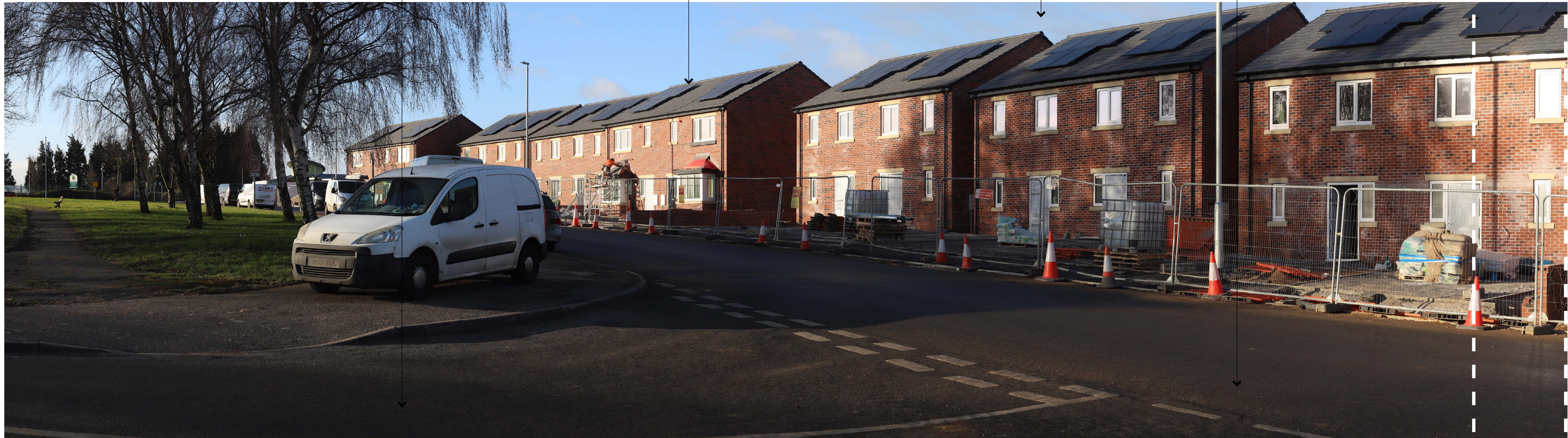
Photo Viewpoint 3: View north-west from the junction of Billingley View and Fairfield, approximately 60m away from the site.

Site (situated behind houses under construction)