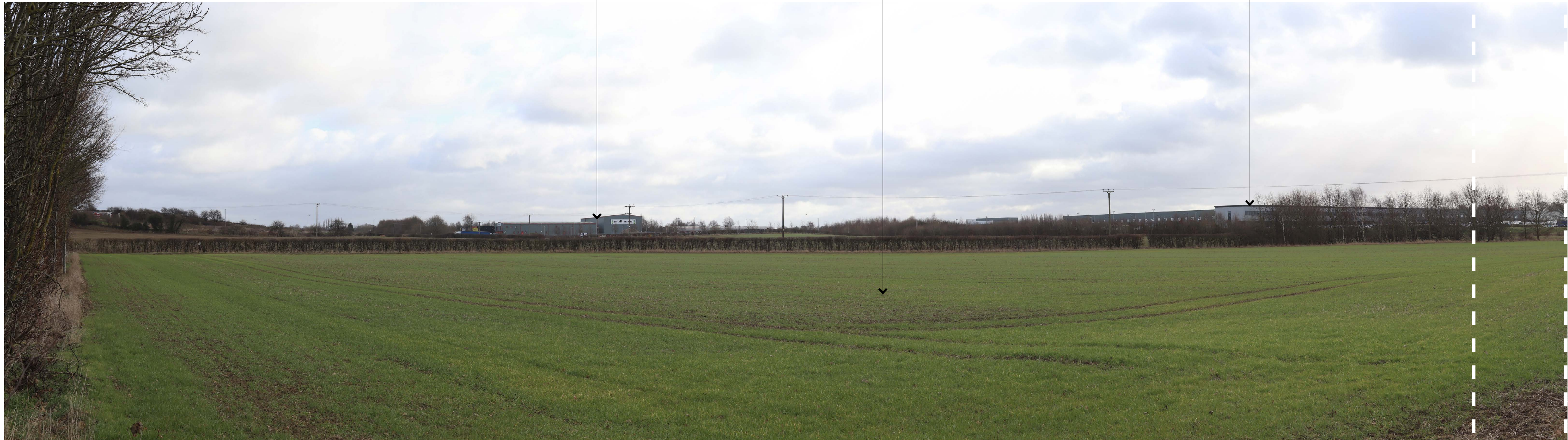
Photo Viewpoint 2: View south-east from Public Footpath 'Billingley CP 5' within the site, near to its northern boundary.