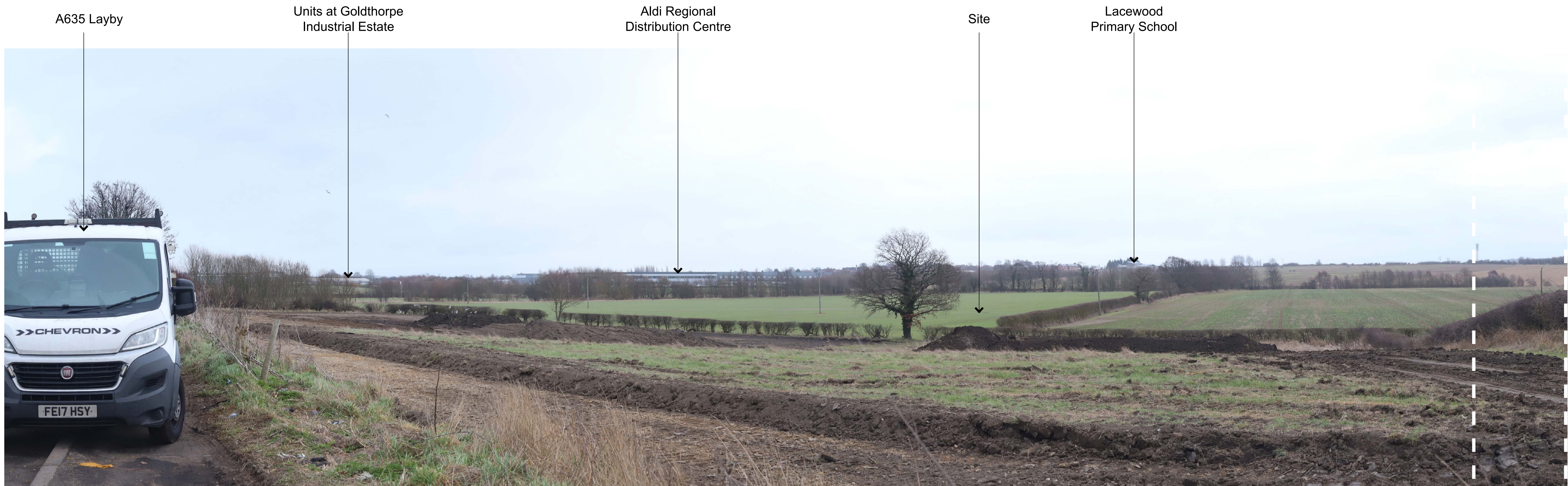
Photo Viewpoint 1: View south-east from the A635, adjacent to the northern boundary of the site.