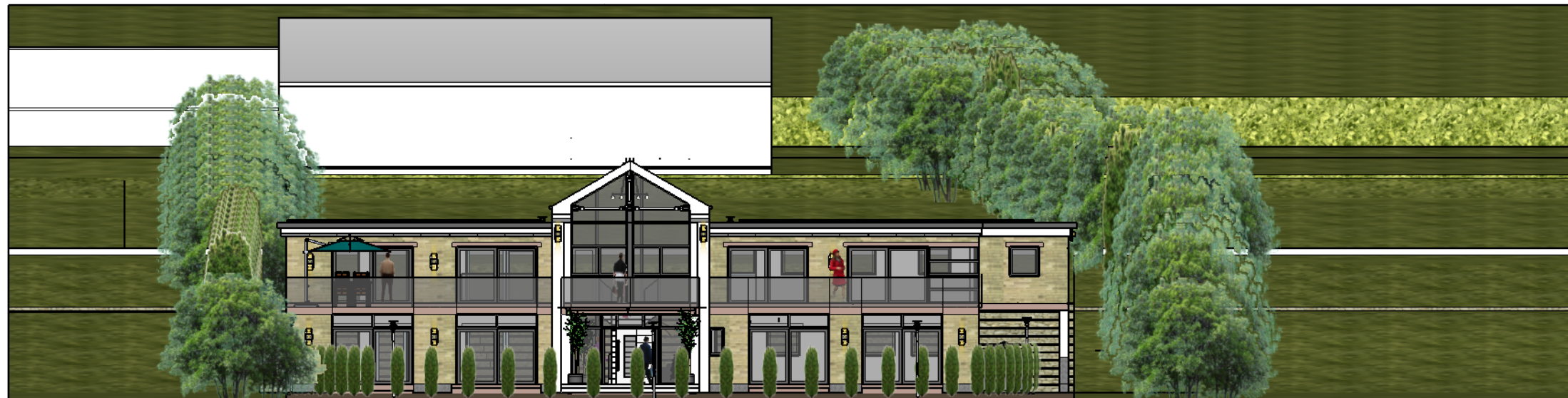
typical site front section elevation

revisions A 9-4-2024 evergreen conifers added to site boundary. pitched roof omitted on the 2 wings and replaced with sedum green flat roof and discrete photovoltaics laid horizontally. grey and white render omitted and replaced with all stone walling. B 10-5-2024 first floor slide back to contain within existing kennel footprint.