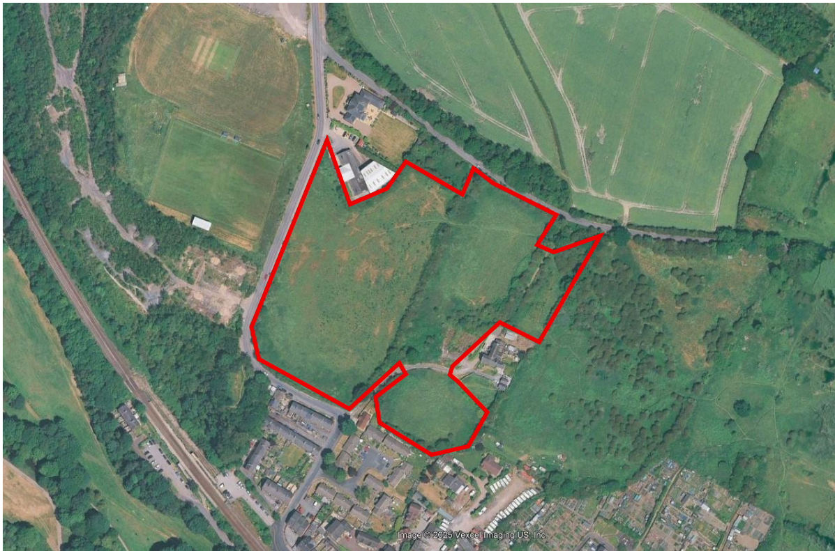
Figure 1.1: Location of proposed residential development

The site is located on land to the south-west of Bloomhouse Lane, circa 5.3 km to the north-west of Barnsley town centre, as shown (highlighted in red) in Figure 1.1.