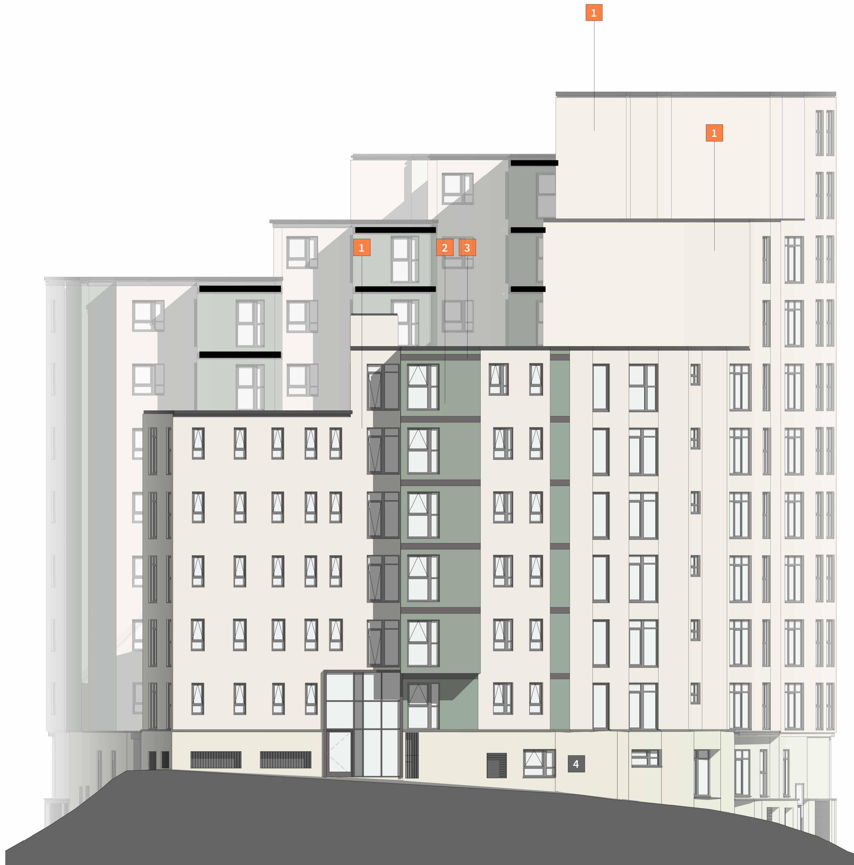
1 Proposed_Elevation - Heelis street-02 1 : 100

NB: REFER TO DRAWINGS, 23-021_FA-DR-200 AND 23-021_FA-DR-201 FOR FURTHER REFERENCE TO EXISTING AND PROPOSED ELEVATION DETAILS.