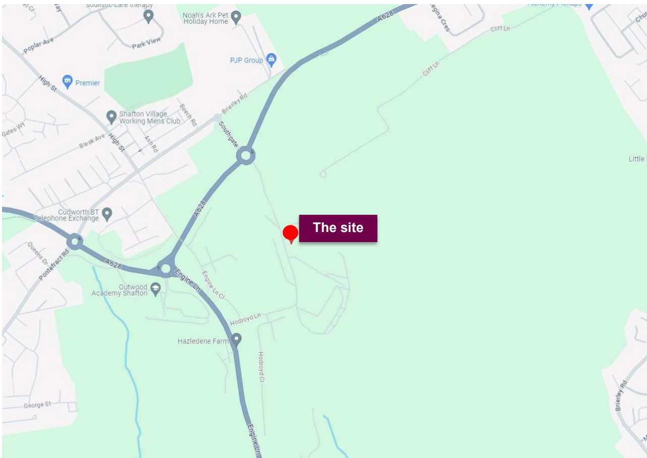
Wider Site Location Map

The application site location is illustrated in the two plans below.