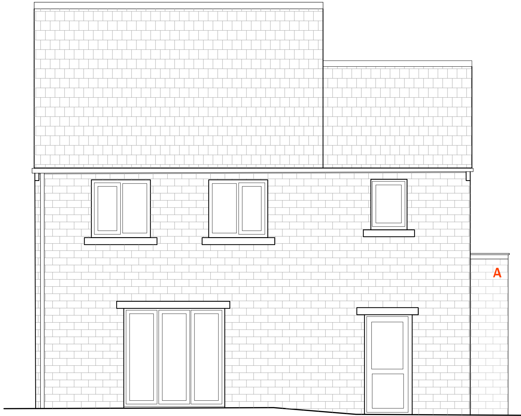
REAR ELEVATION - PROPOSED 1:50

Do not scale from the drawings. Dimensions to be checked on site, where discrepancies occur, seek advice from the client's representative for clarification. The drawings & specifications are a guide as to what is required to comply with the current building regulations. This does not imply that this is the only acceptable way of achieving building regulations approval. Alternative 'similar approved' products may be used at the discretion of the Building Inspector. No liability is accepted for any loss of any sort or additional expense incurred consequent on any variation to the layout or specification that may be required as a result of site conditions, availability of materials, custom or practice, the requirements of the Building Inspector or any other circumstances. All dimensions are show to the face of the structural element - face of brick/stud/block and do not account for finishes.