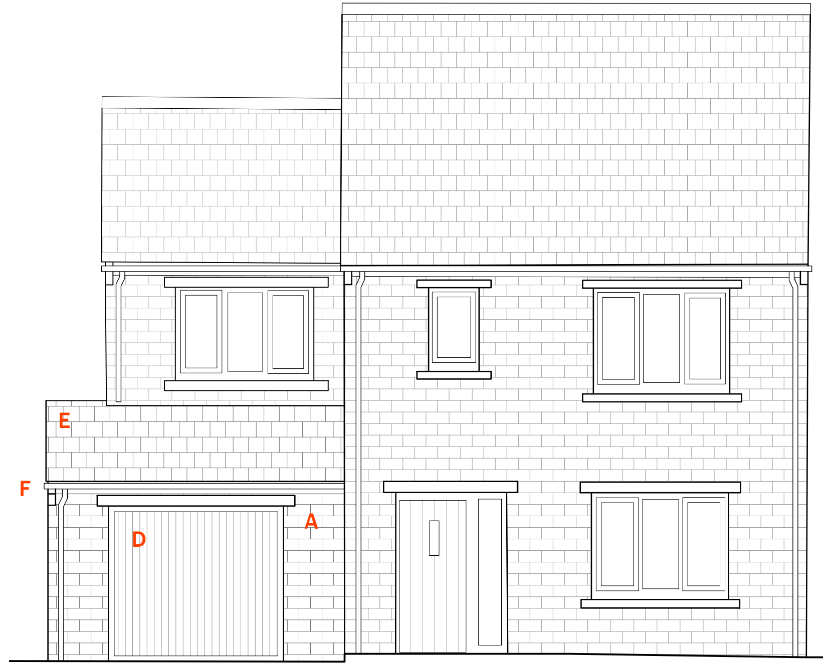
FRONT ELEVATION - PROPOSED 1:50