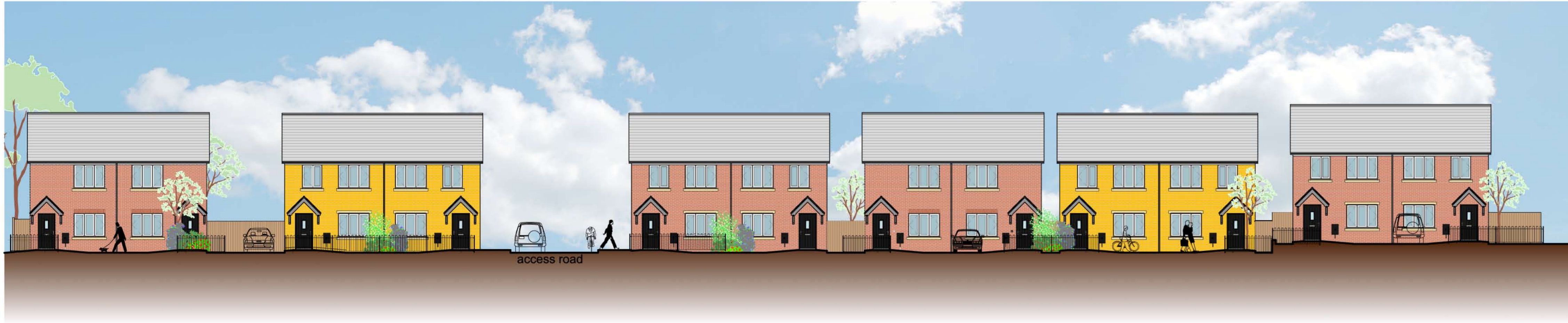
Street Elevation A-A fronting Nanny Marr Road scale 1:150