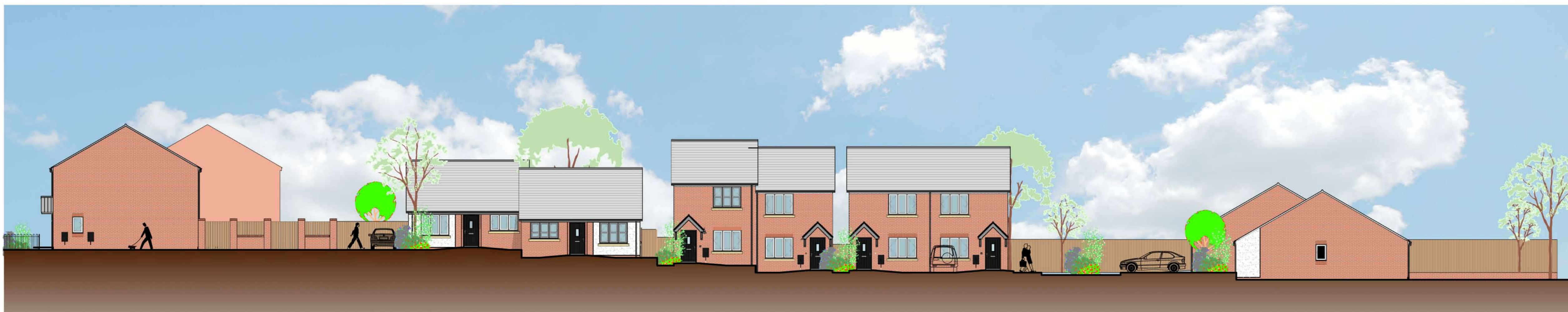
Street Elevation C-C scale 1:150