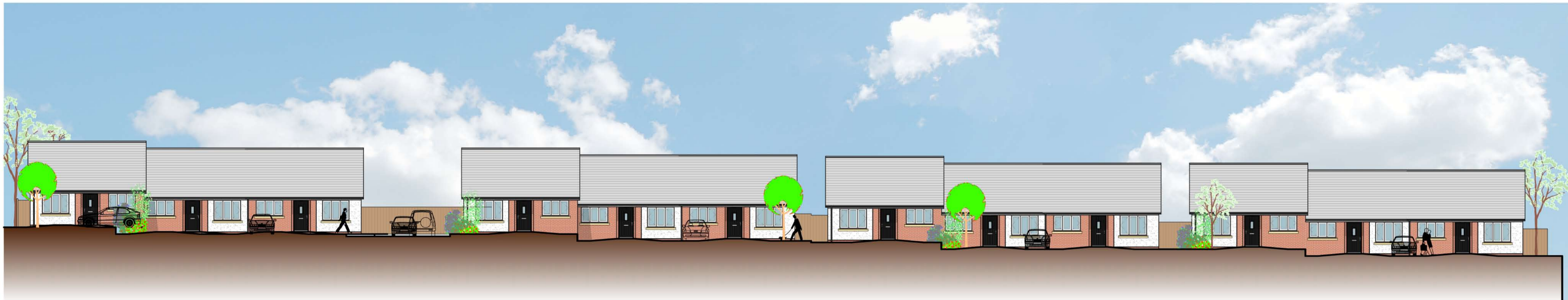
Street Elevation B-B scale 1:150