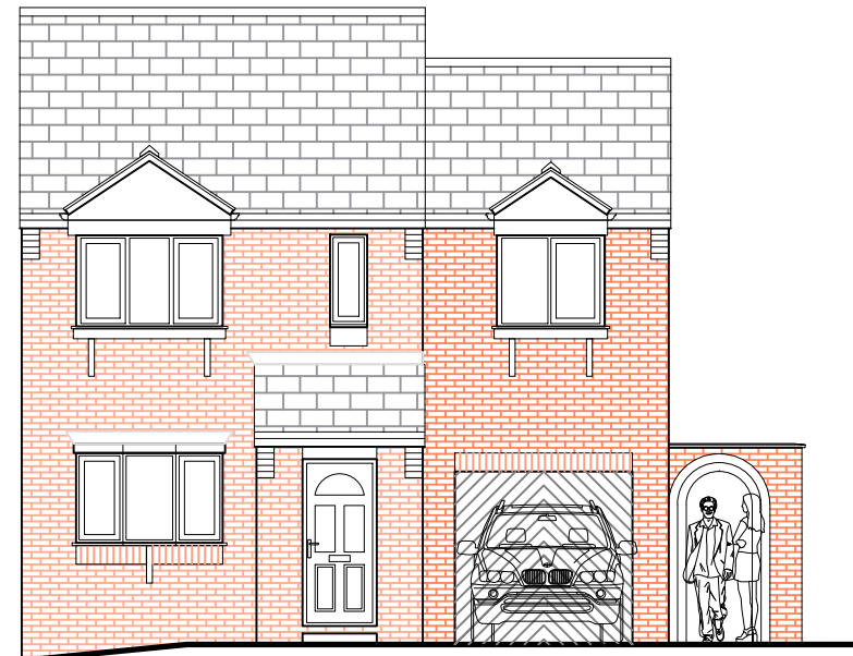
Proposed Front Elevation (unaffected)