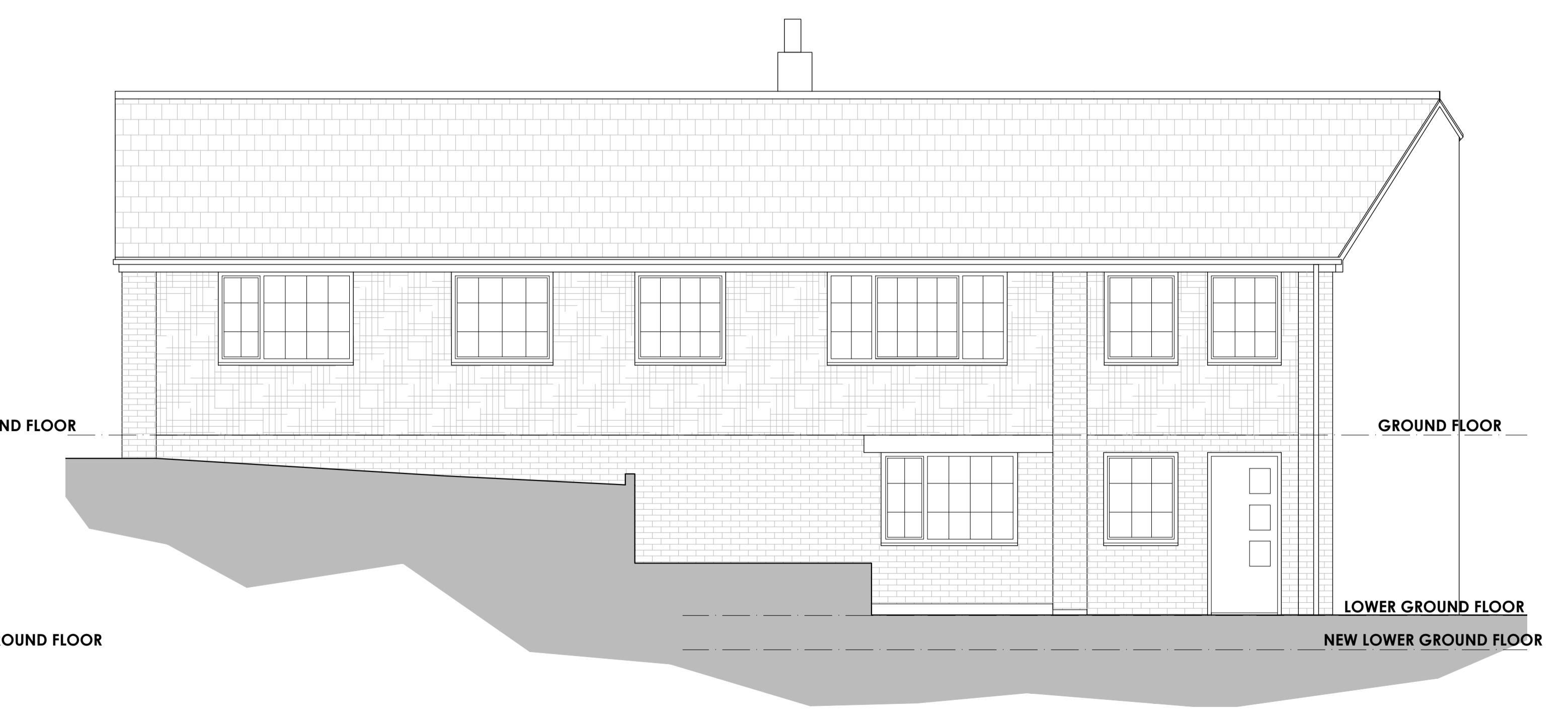
FRONT ELEVATION - as proposed Scale 1:50 @ A1