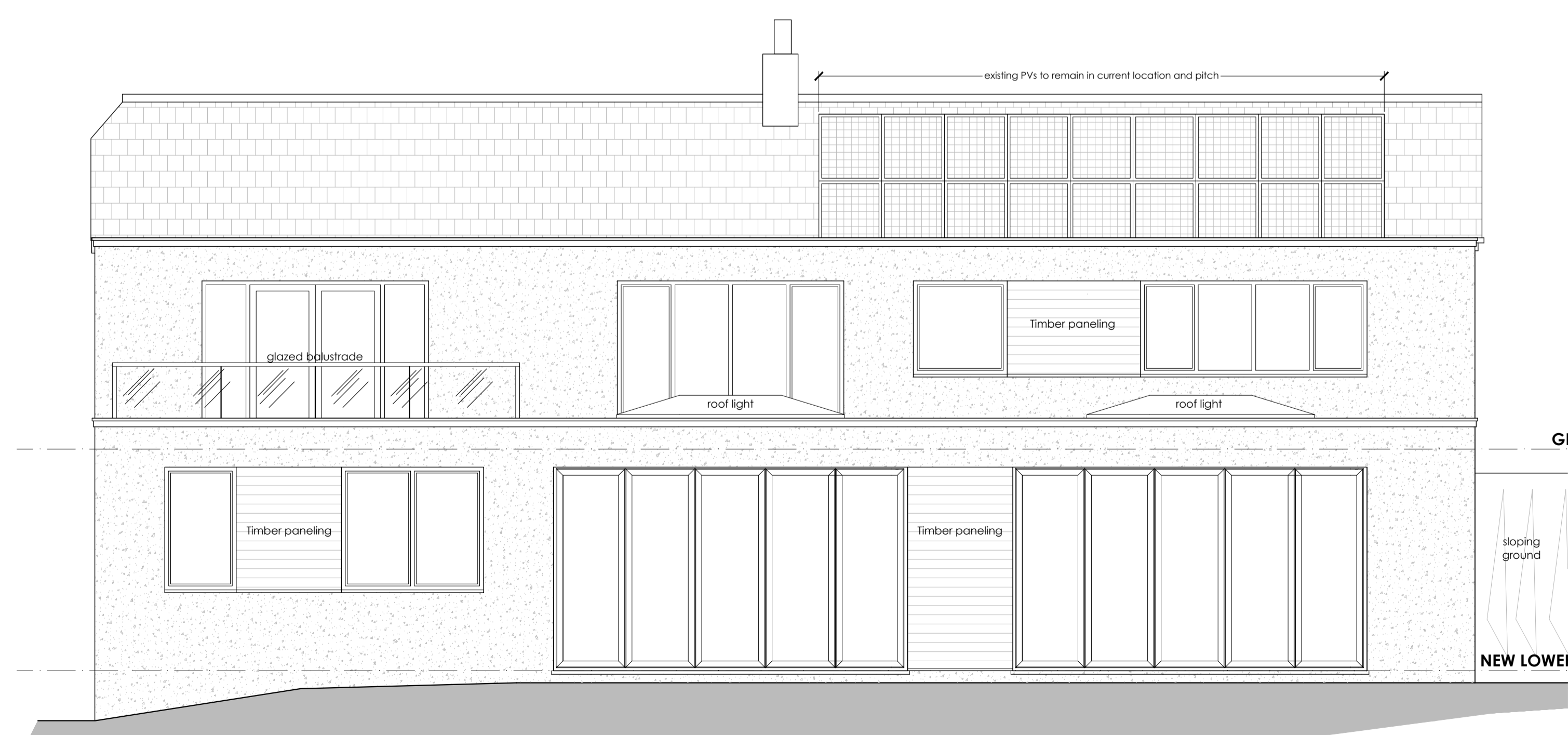
REAR ELEVATION - as proposed Scale 1:50 @ A1