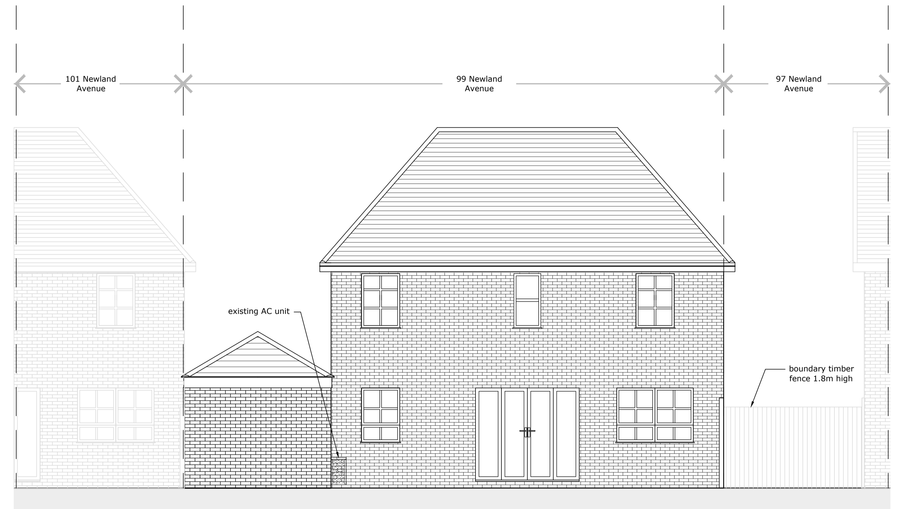
rear elevation (north facing) as existing 1:50